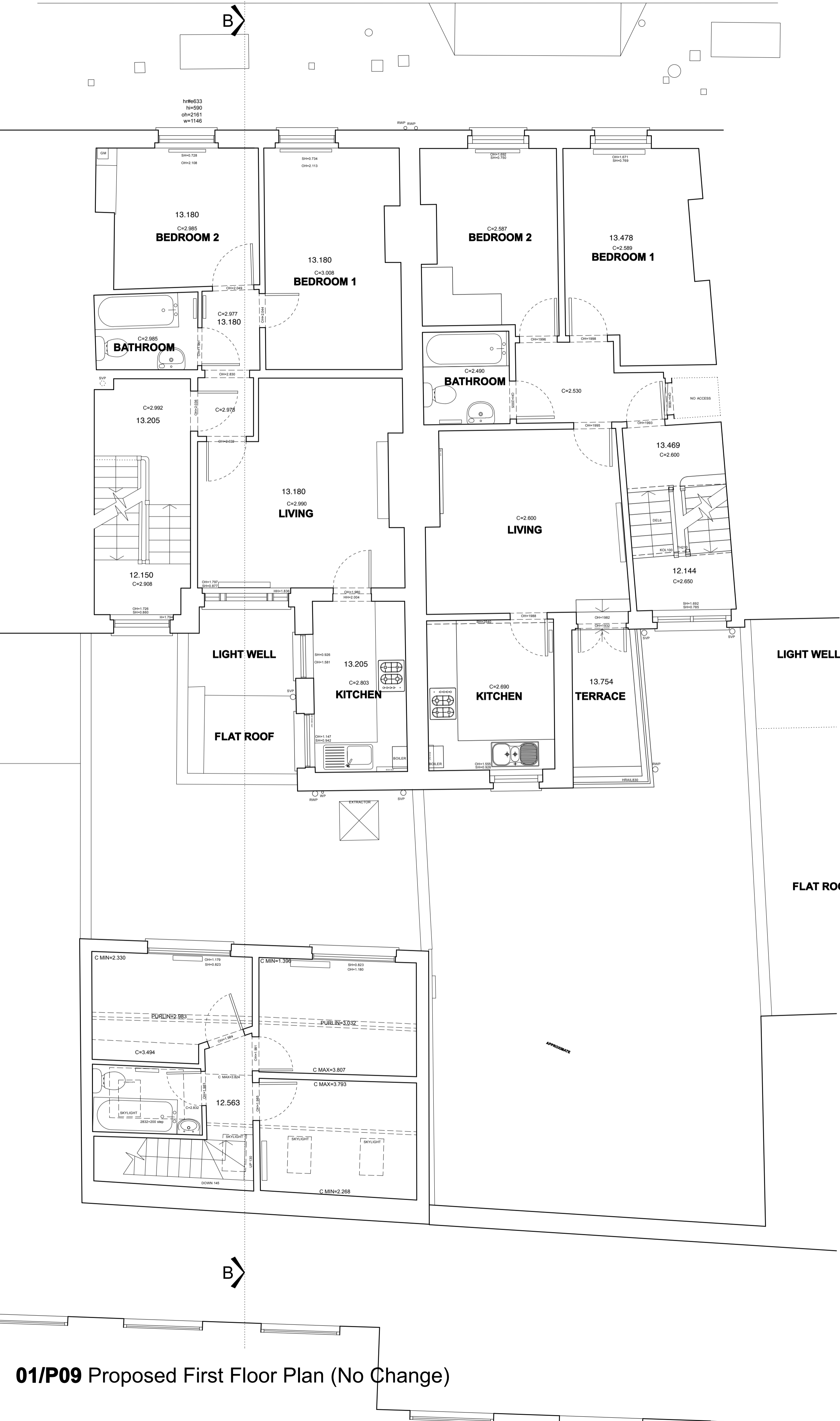
01/P09 Proposed First Floor Plan (No Change)