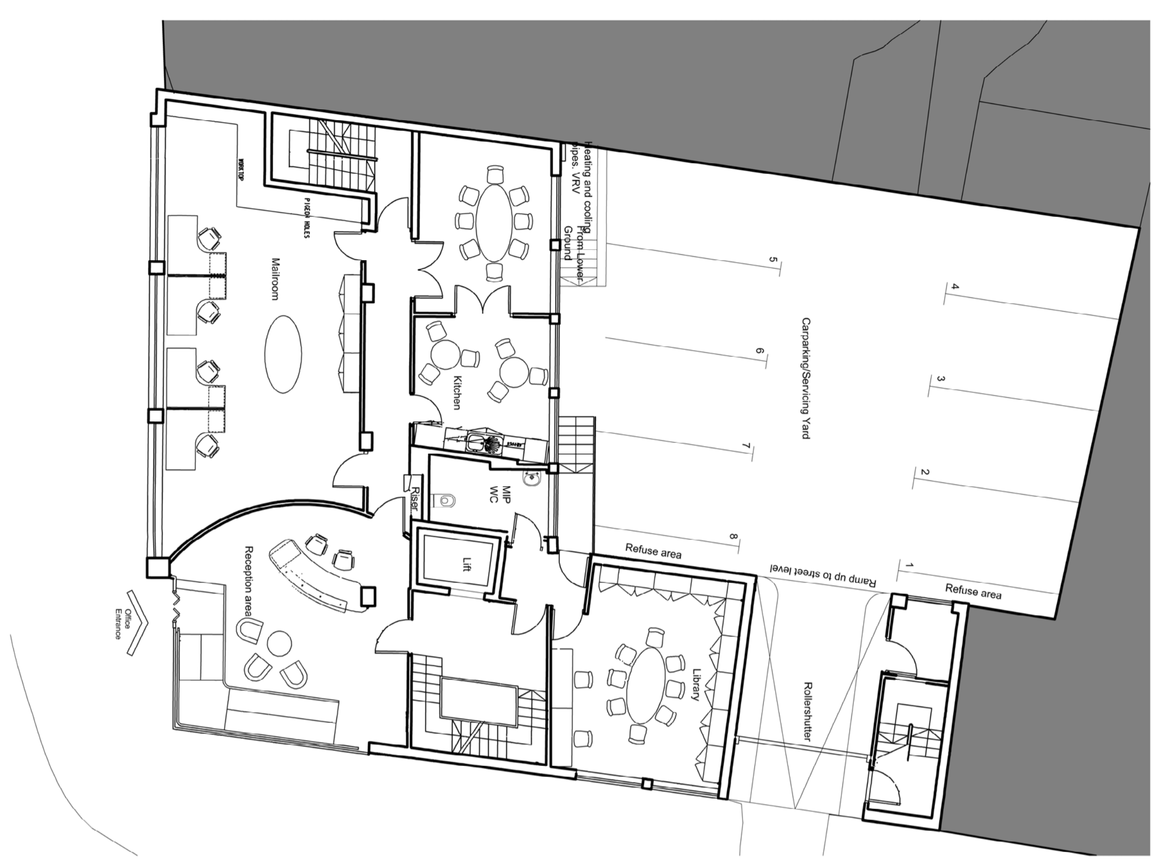
1 Existing floor plan 1:100