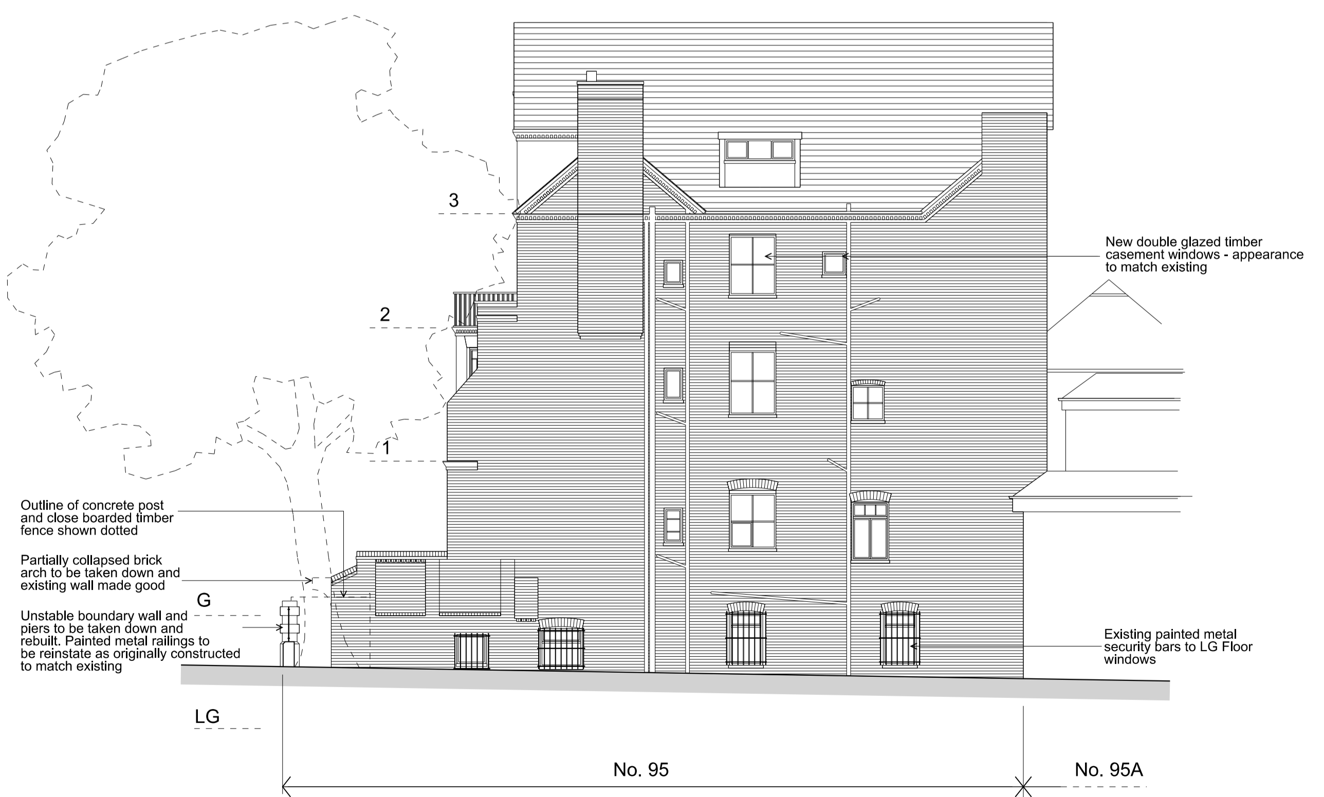
Proposed Side Elevation to Perrins Walk