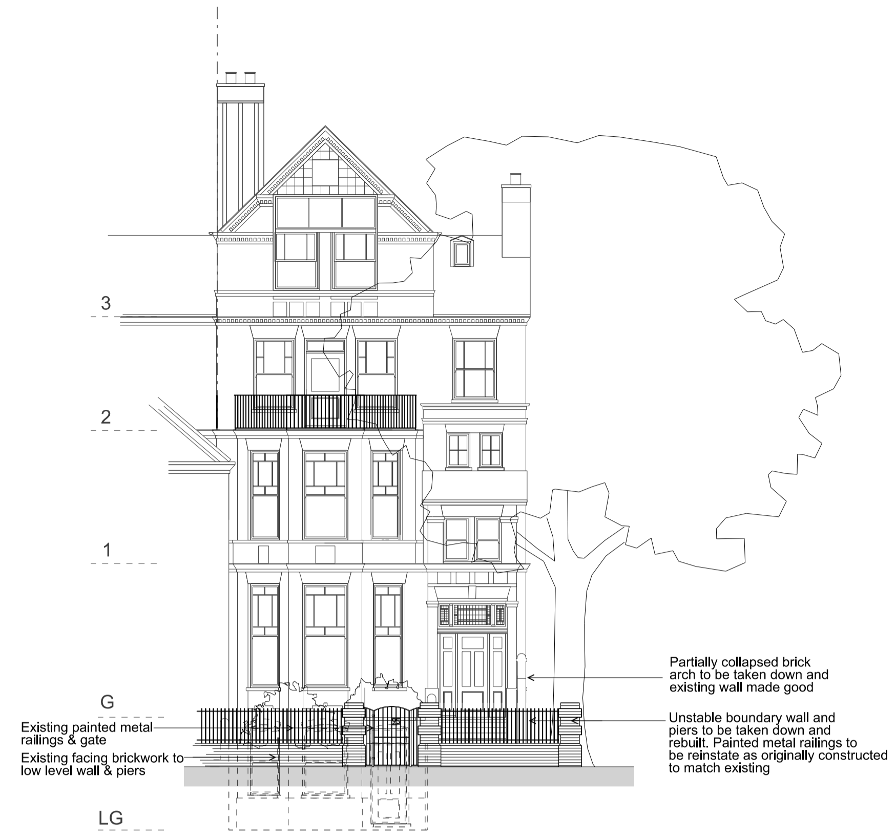
Proposed Front Elevation to Fitzjohn's Avenue Showing Boundary