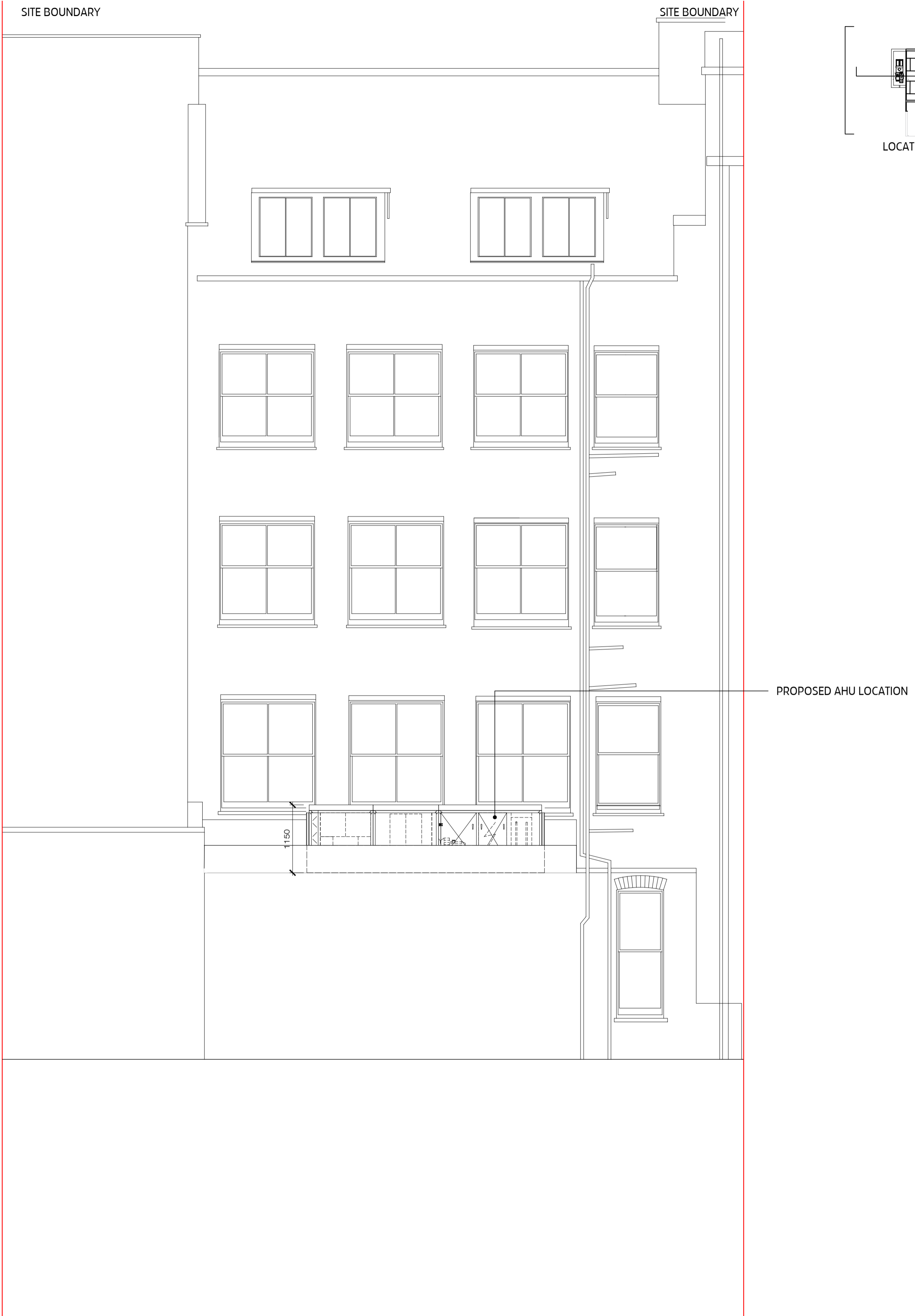
02 EAST ELEVATION SCALE 1:50@ A1

MOXON LONDON Great Western Studios, 65 Alfred Road, London W2 5EU t 0207 034 0088 f + 0207 034 0099 SCOTLAND Artists, Crafters, Aberdeen AB35 5LN m 0774 061 9198 mal@moxonarchitects.com | www.moxonarchitects.com