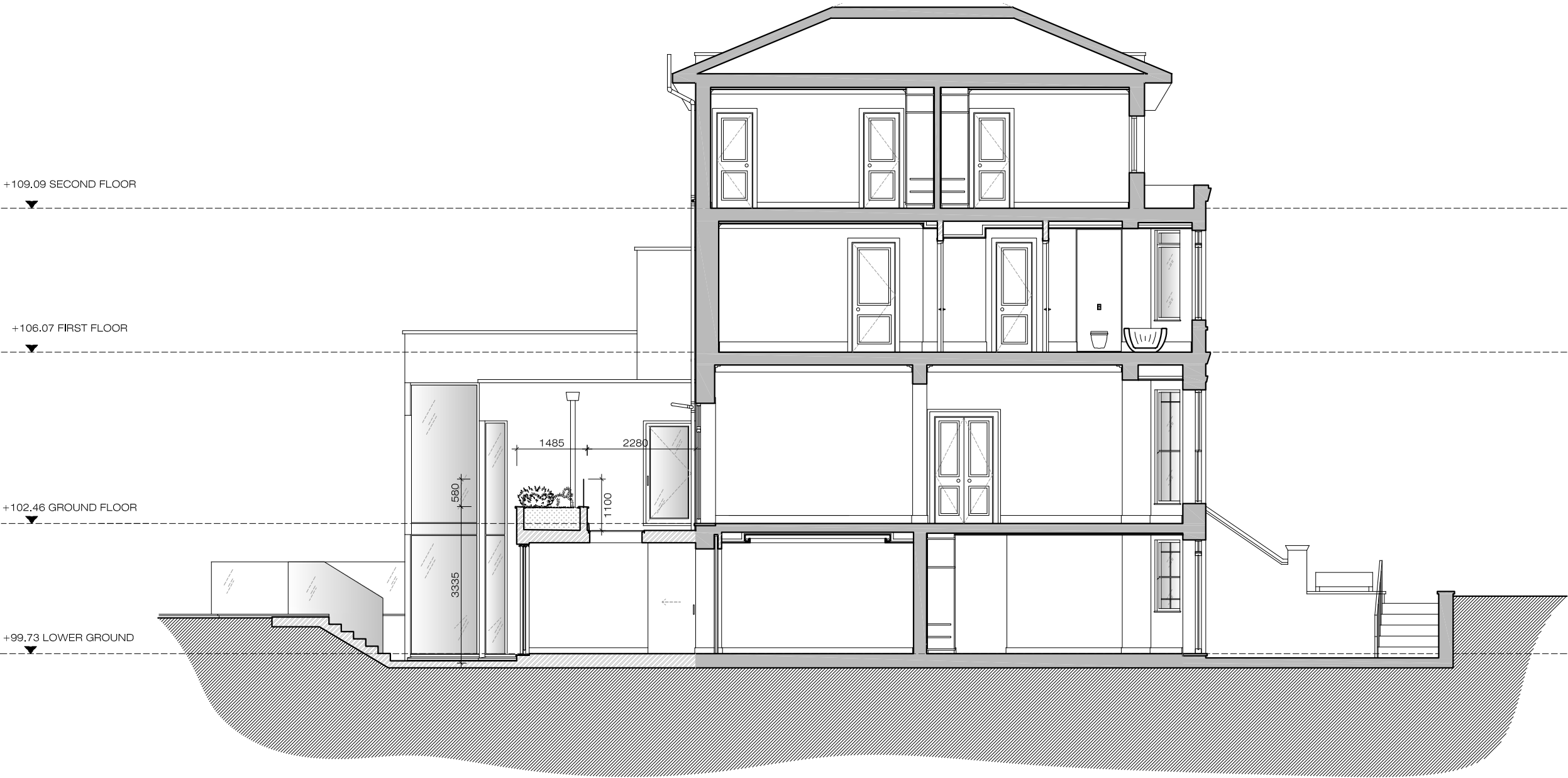
01 Section BB scale: 1:100 14_09