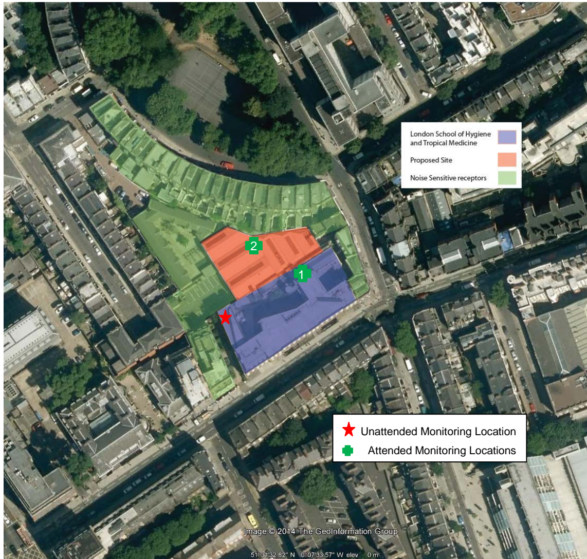
Figure 2: Measurement Locations