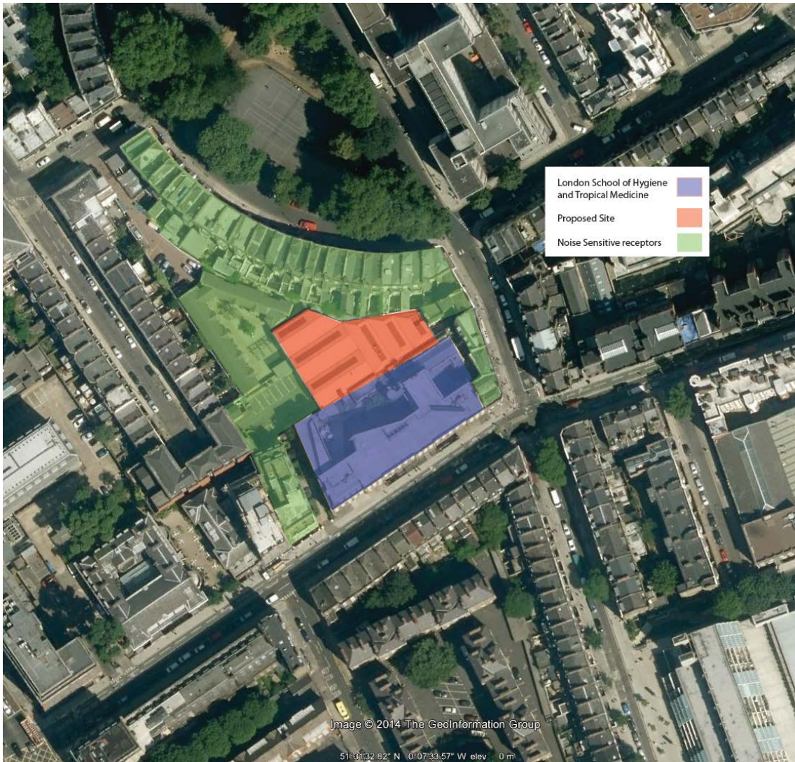
Figure 1: Proposed Site Location