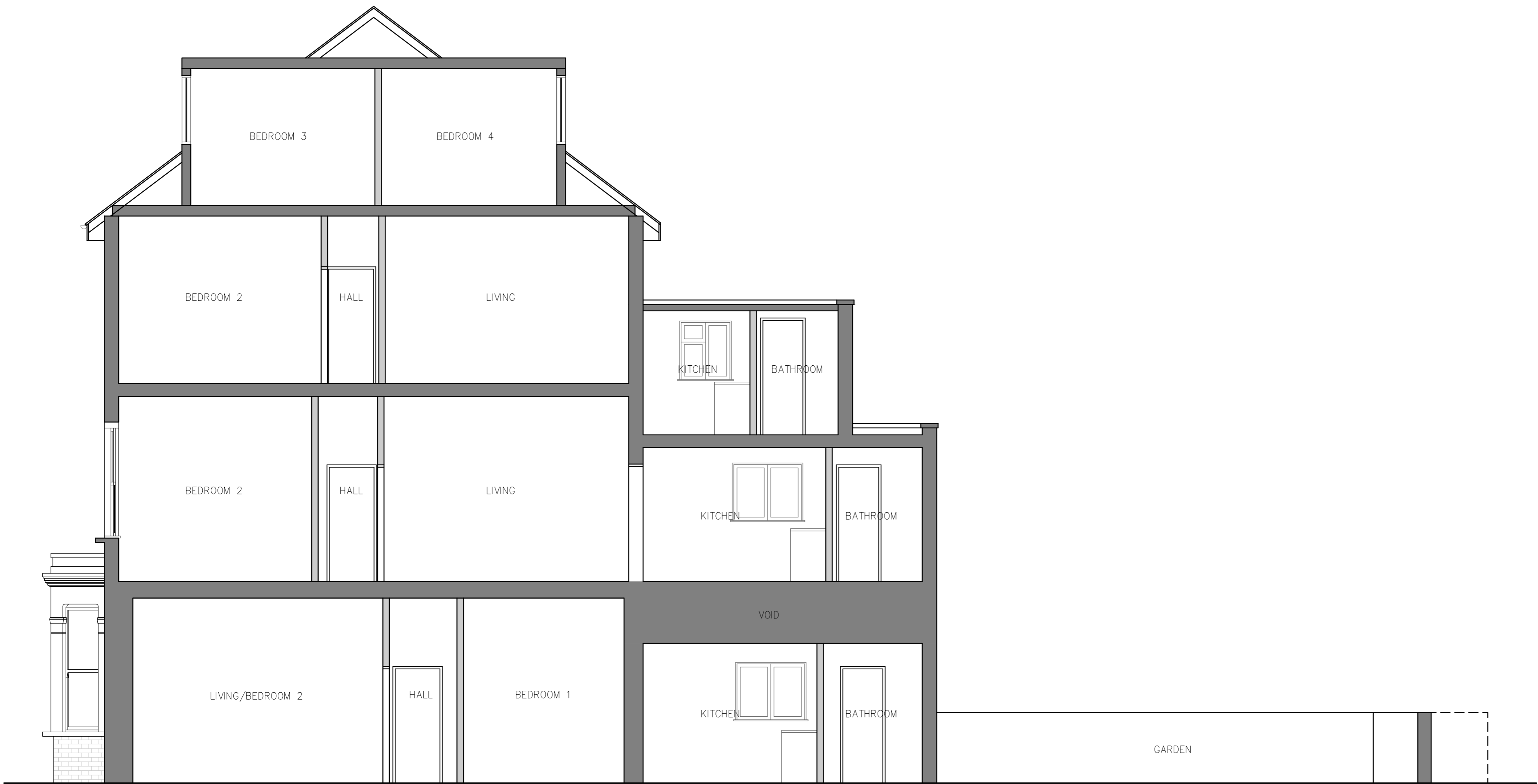
EXISTING SECTION A-A