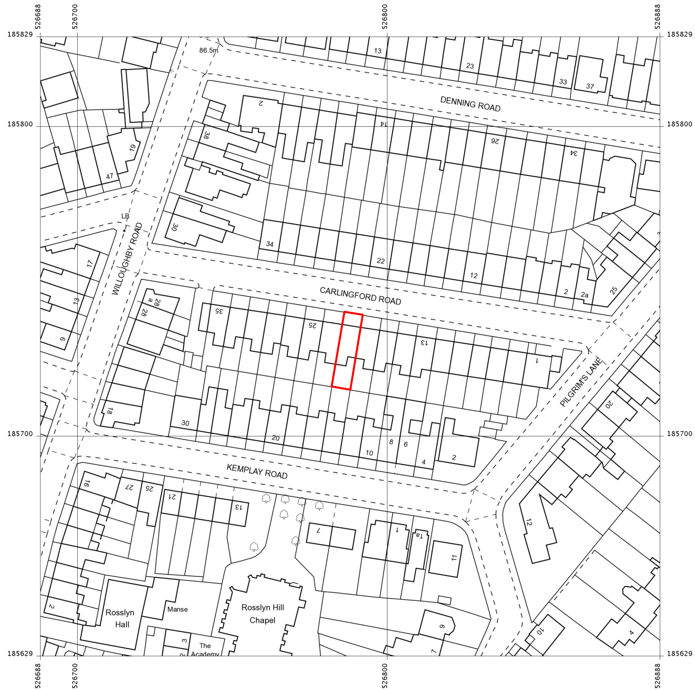
OS PLAN Scale 1:1250@A3