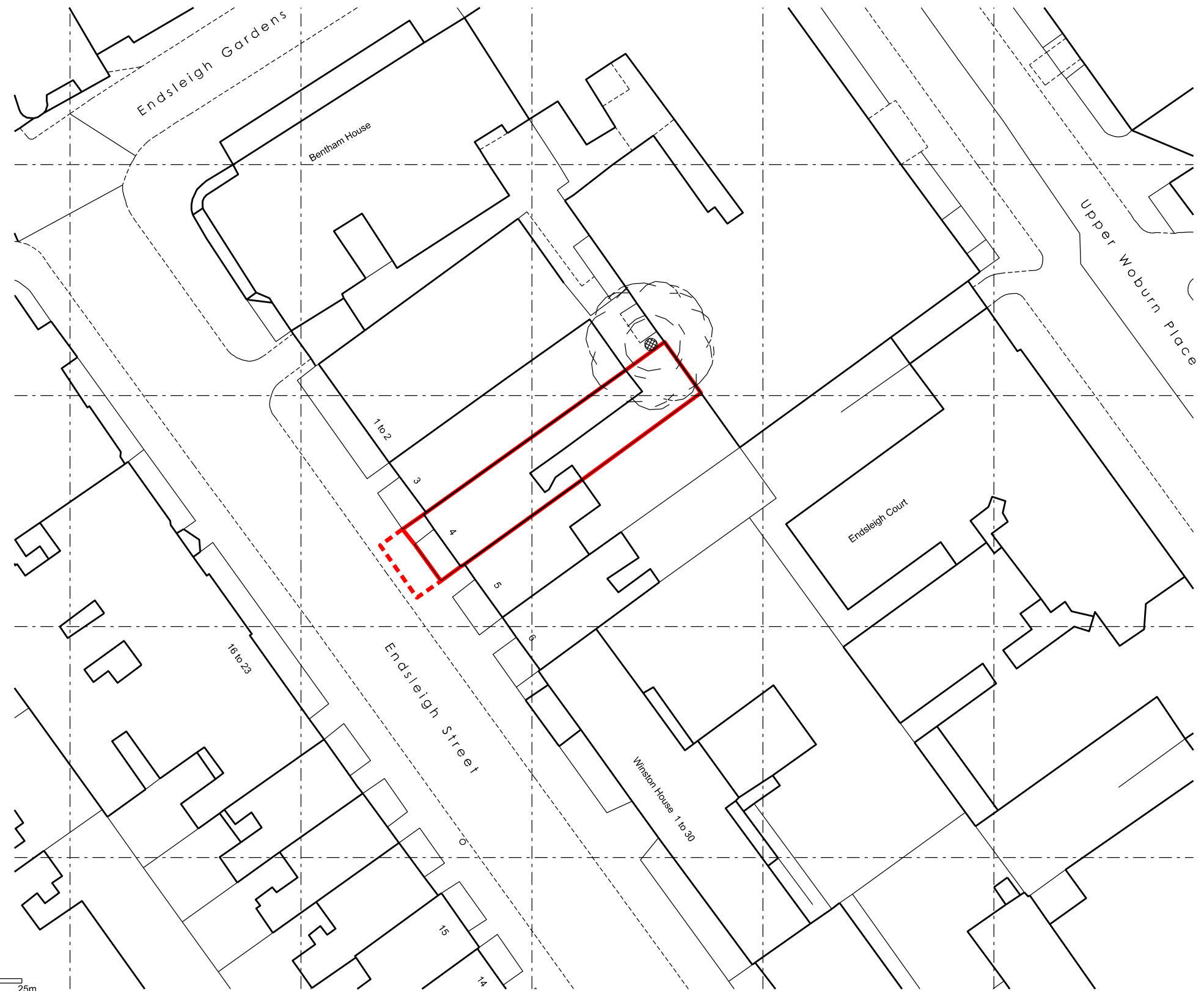
Existing Block Plan - 1:500