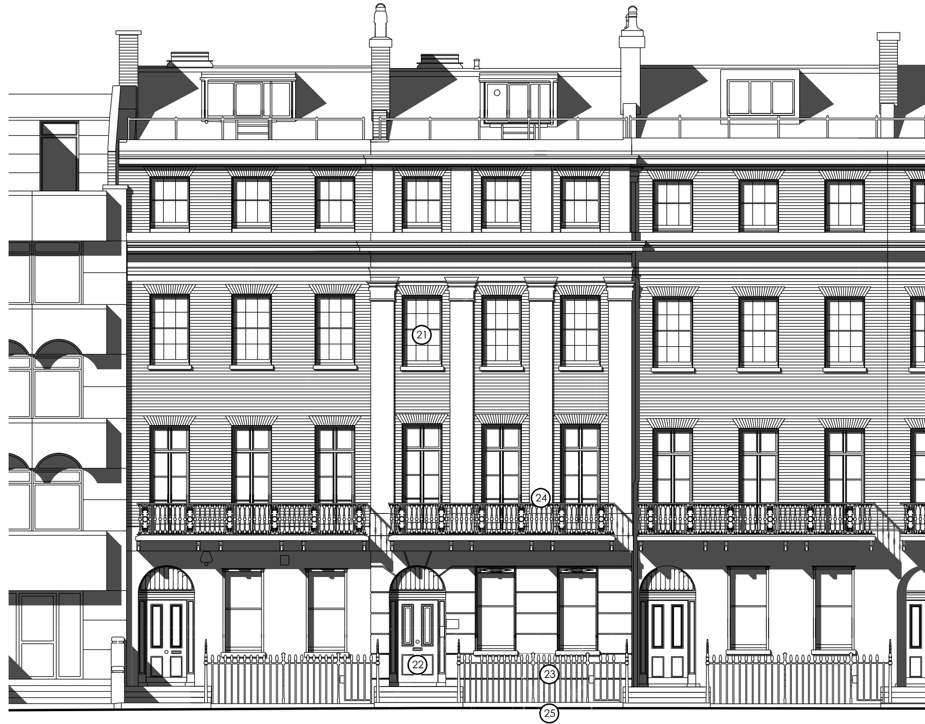
Proposed Endsleigh Street elevation

No. 1 - 2 No. 3 Endsleigh Street No. 4 Endsleigh Street No. 5 Endsleigh Street No. 6