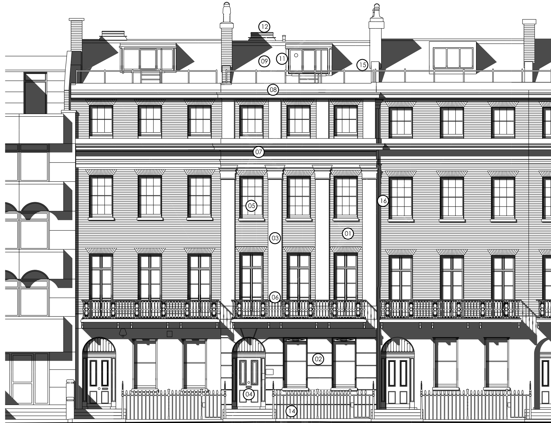
Existing Endsleigh Street elevation