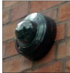
(10. image of specified camera)