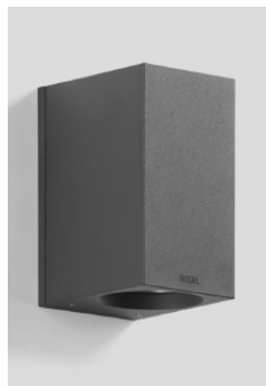
(6. image of specified light fitting)