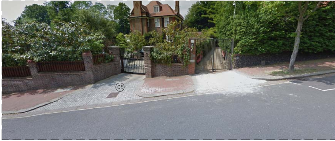
Photo of view from street