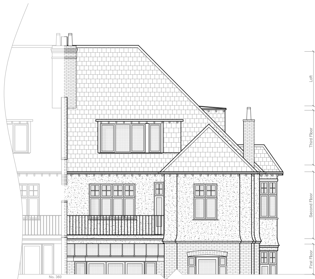
Rear Elevation As Existing