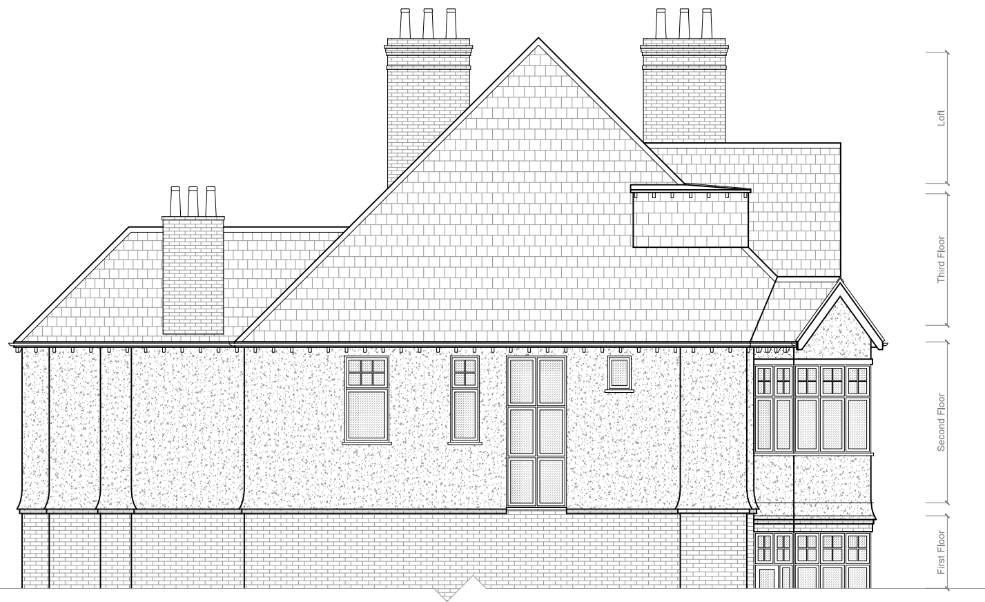
Side Elevation As Existing