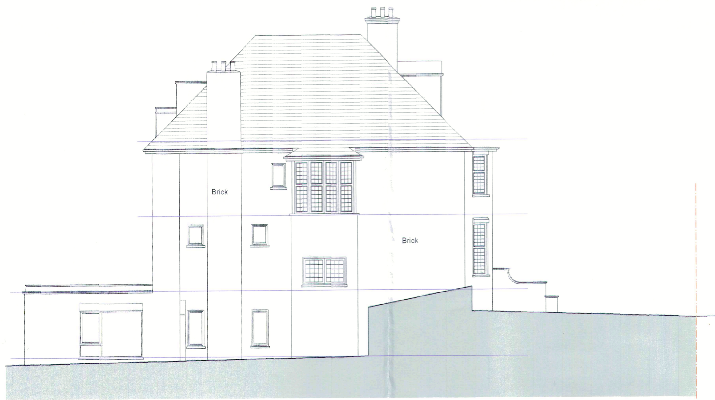
EXISTING SIDE (SOUTH EAST) ELEVATION 1:100