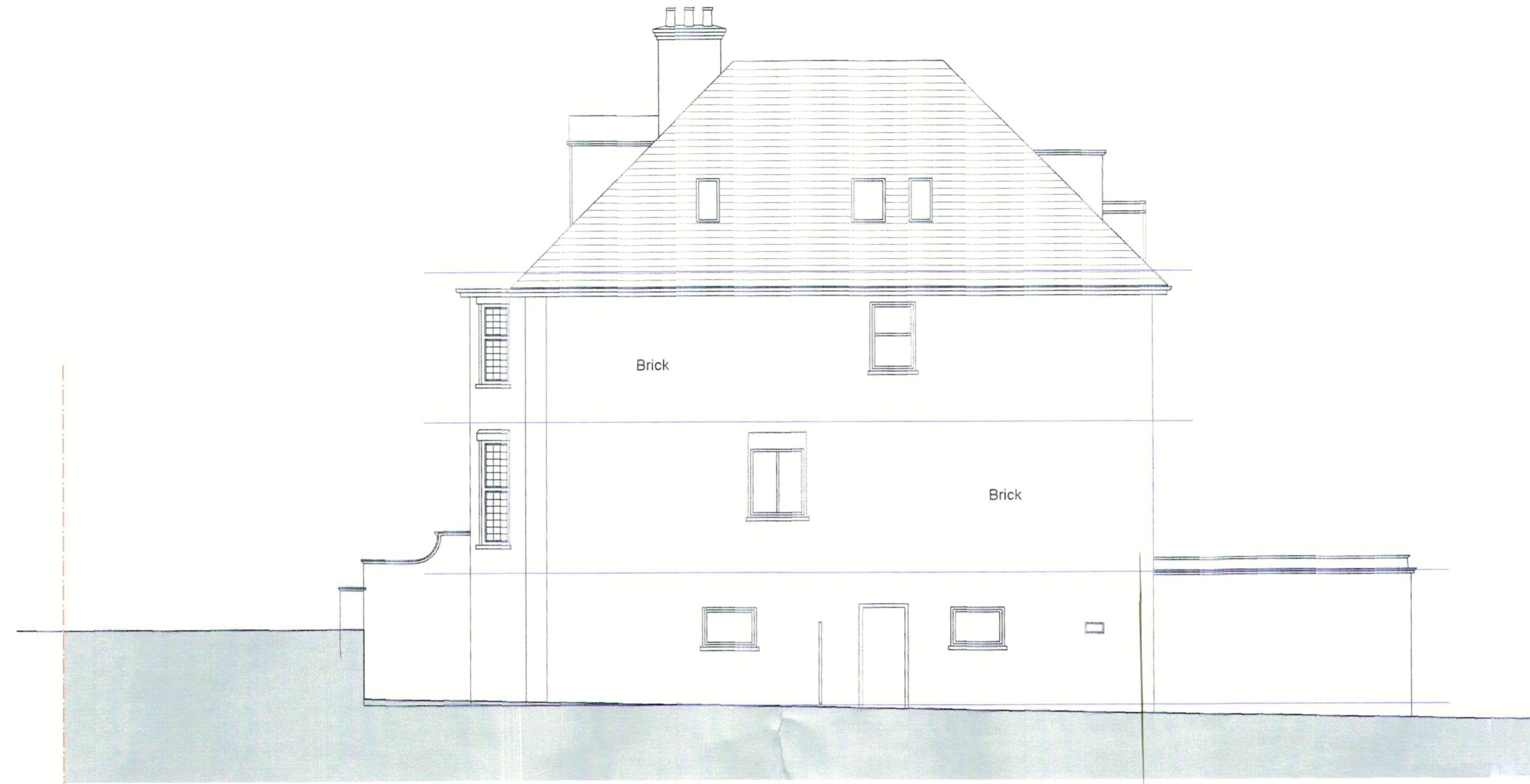
EXISTING SIDE (NORTH WEST) ELEVATION 1:100