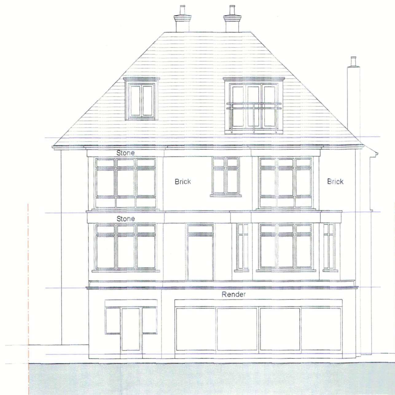
EXISTING REAR (SOUTH WEST) ELEVATION 1:100