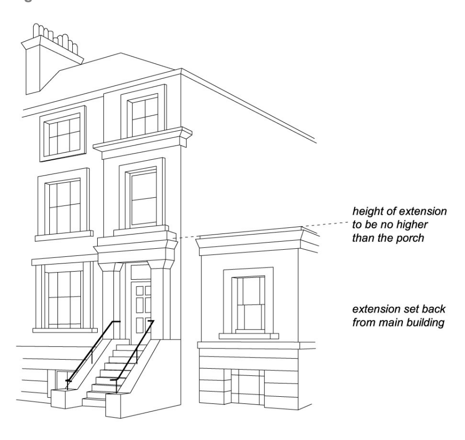
Figure 3. Side extensions