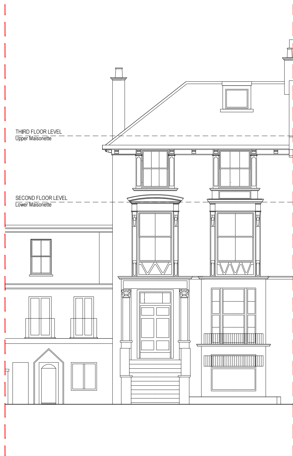
Existing - Front Elevation (South West) SCALE : 1:100 @ A3

note: Do not scale from this drawing. All dimensions to be checked on site.