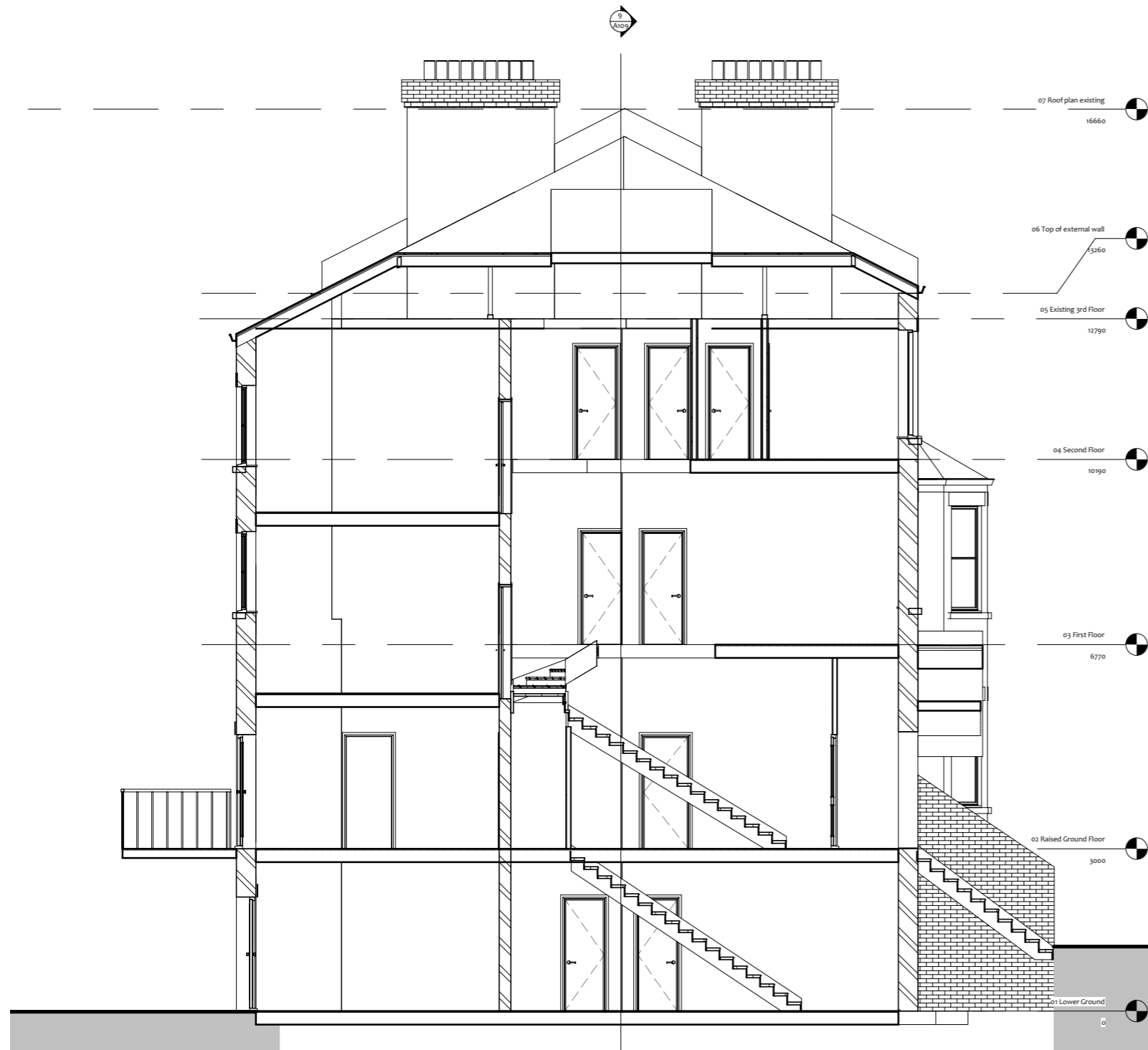
Section 1 1 : 100