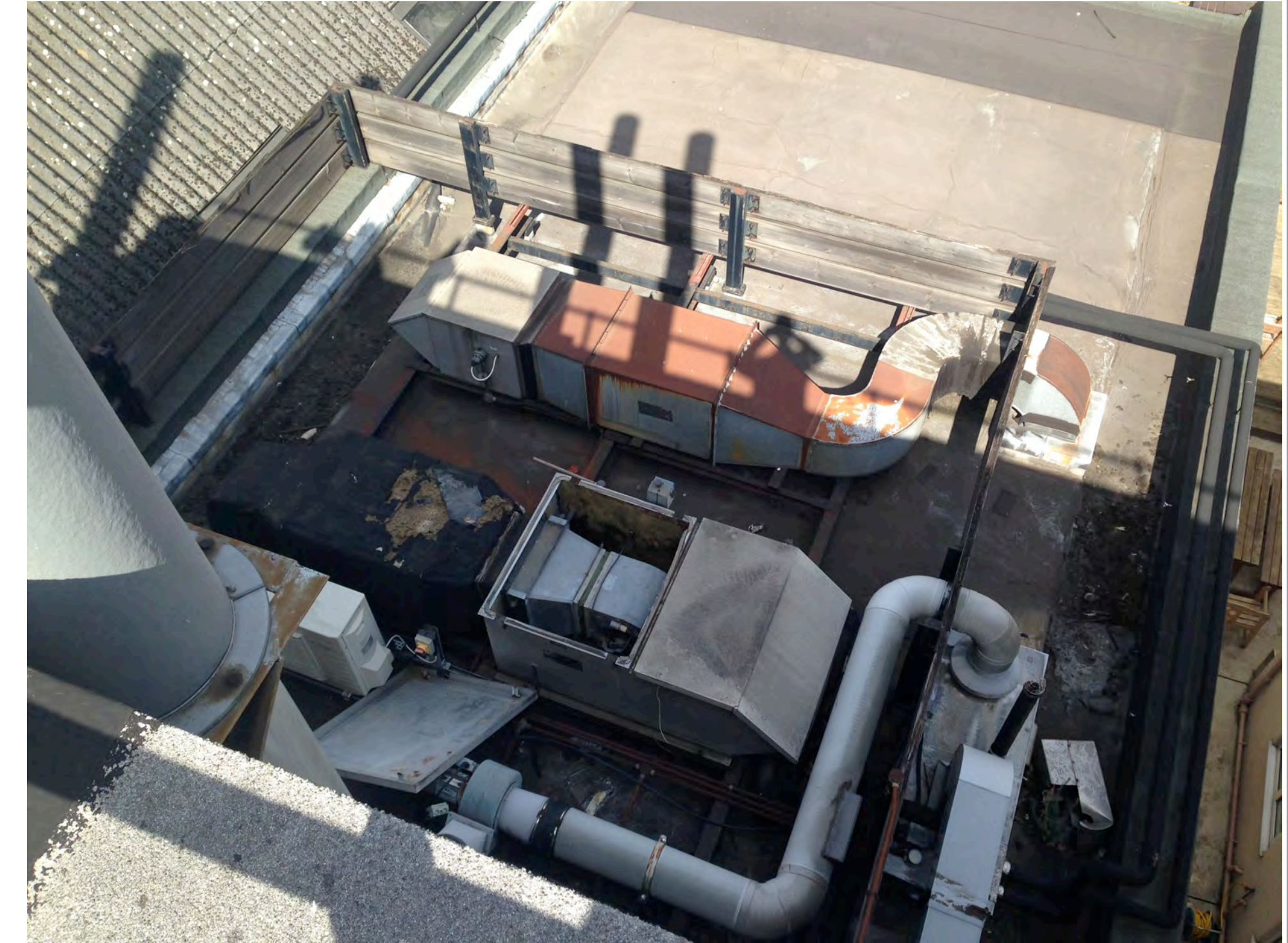
Photograph B: Existing Rooftop Plant Area