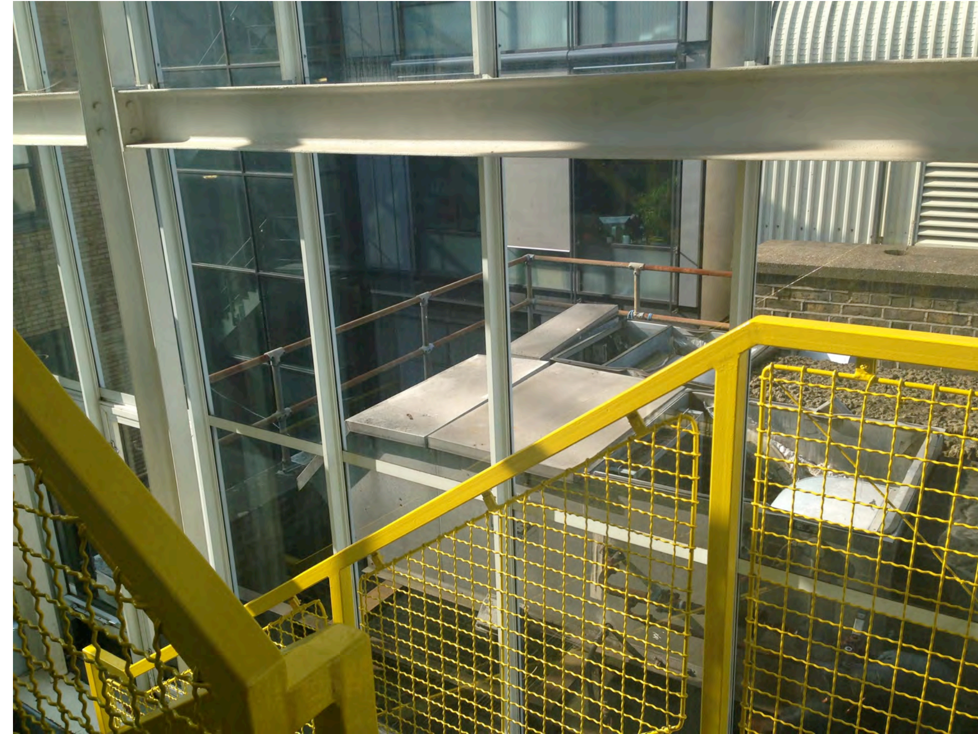
Photograph A: Existing Rooftop Plant Area