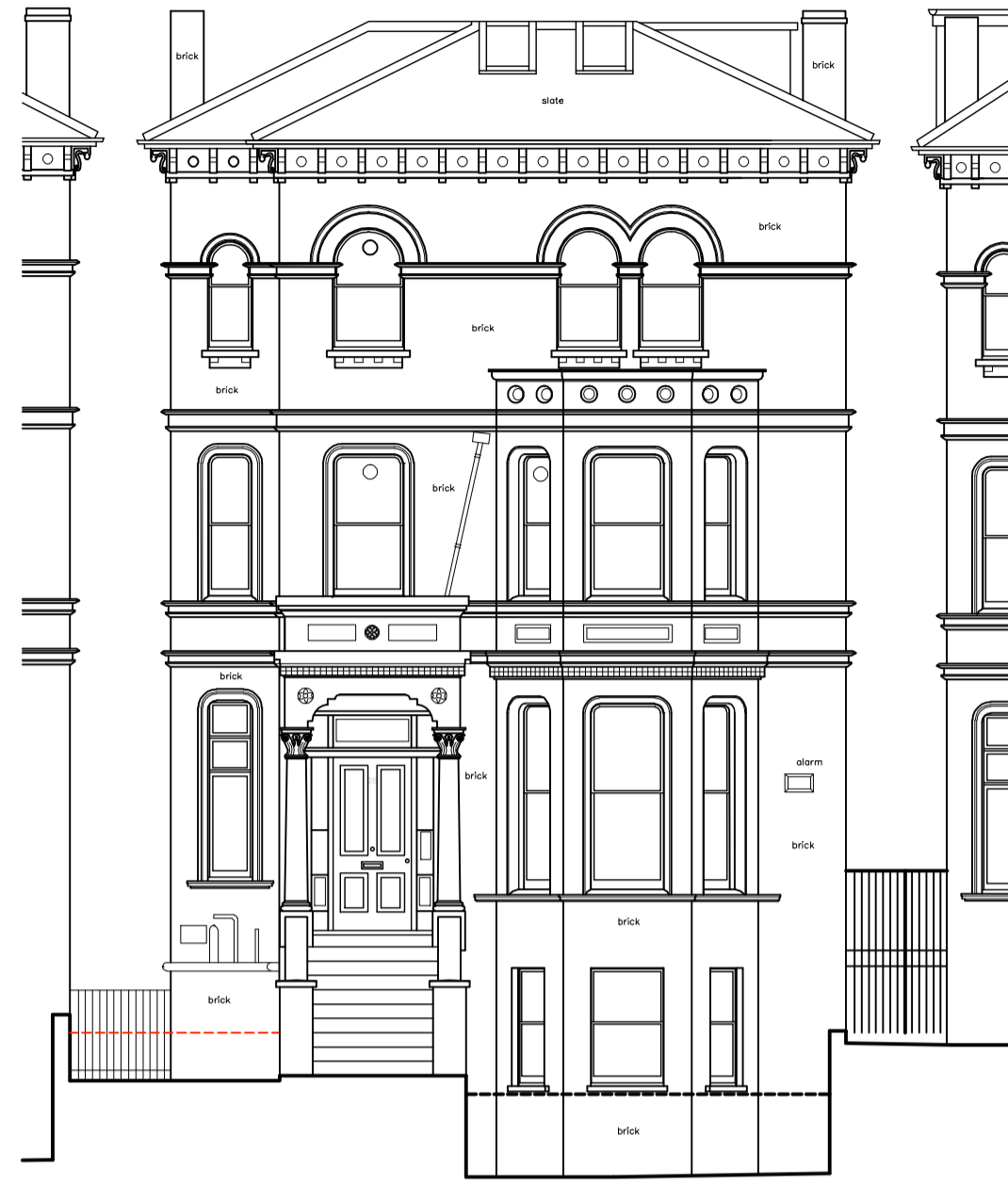
South Elevation (Lancaster Grove)