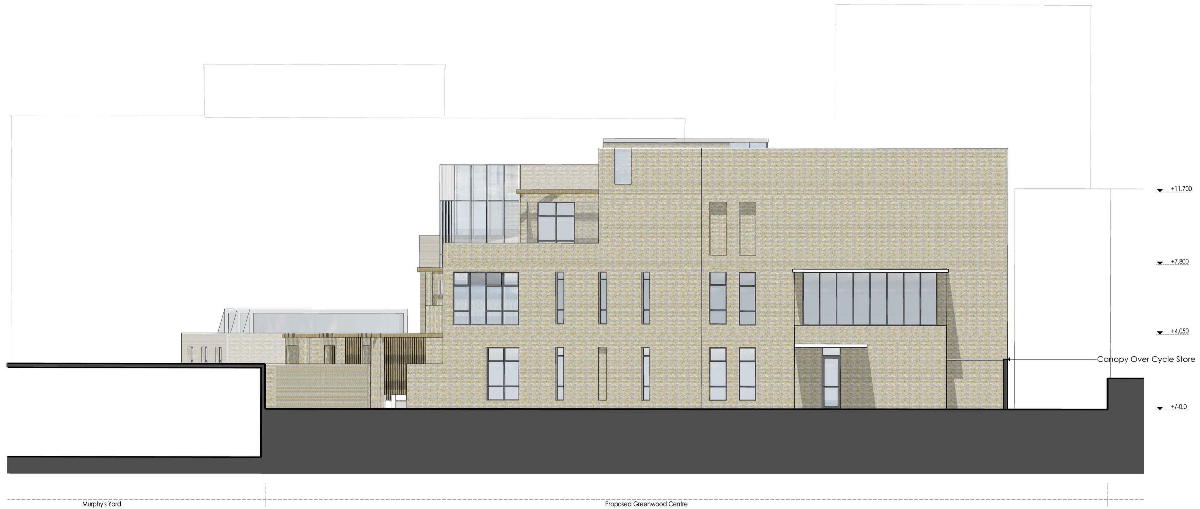
EAST ELEVATION 3-3