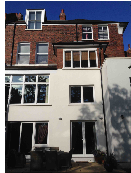
REAR ELEVATION - B.