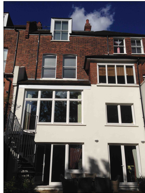
REAR ELEVATION - A.