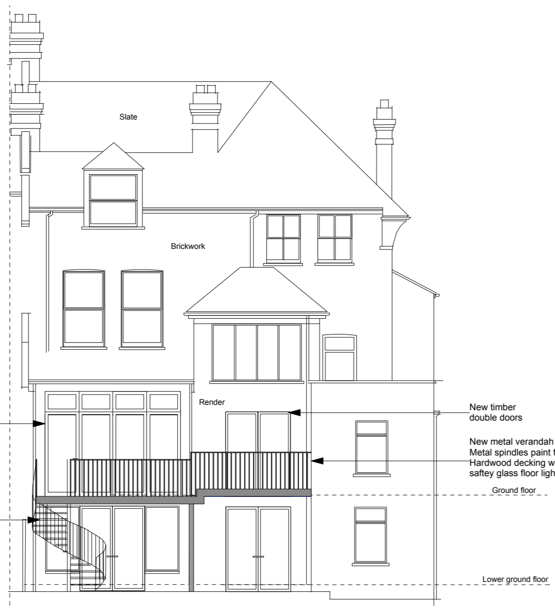
REAR ELEVATION - PROPOSED

New timber bi-fold doors with separate opening leaf New metal spiral staircase paint finish. Metal spindles paint finished