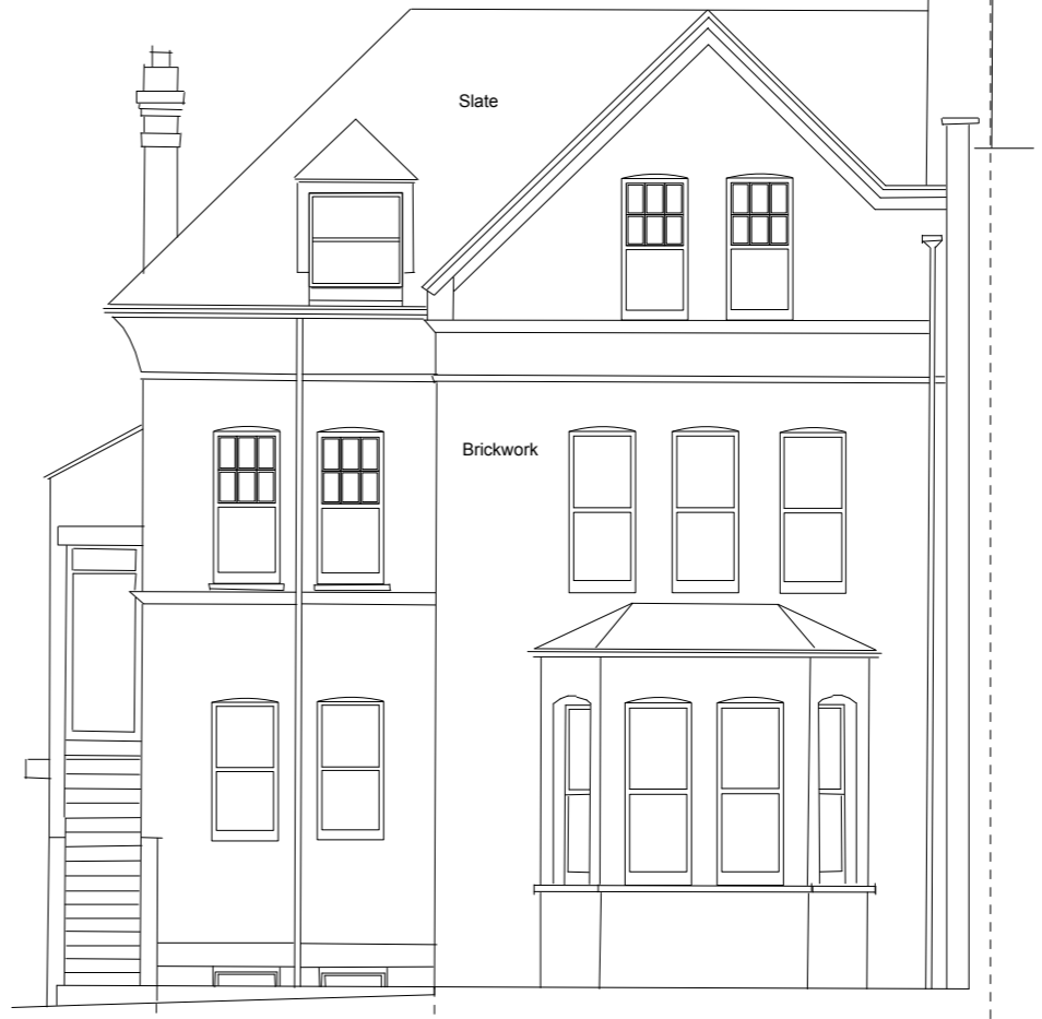
FRONT ELEVATION - PROPOSED