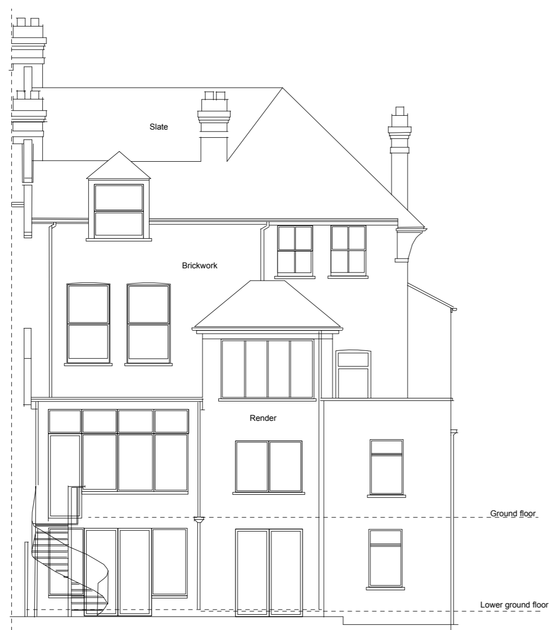
REAR ELEVATION - EXISTING