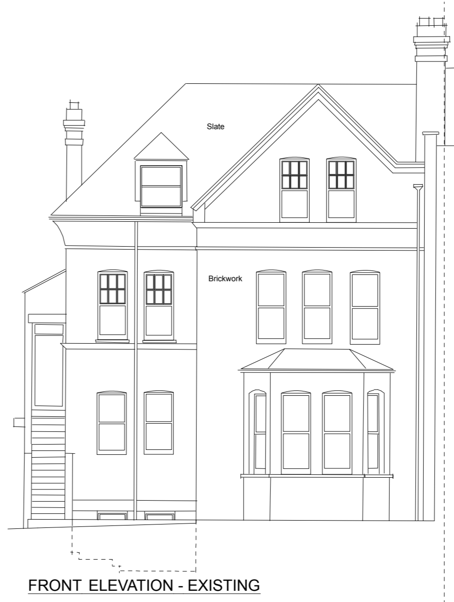
FRONT ELEVATION - EXISTING