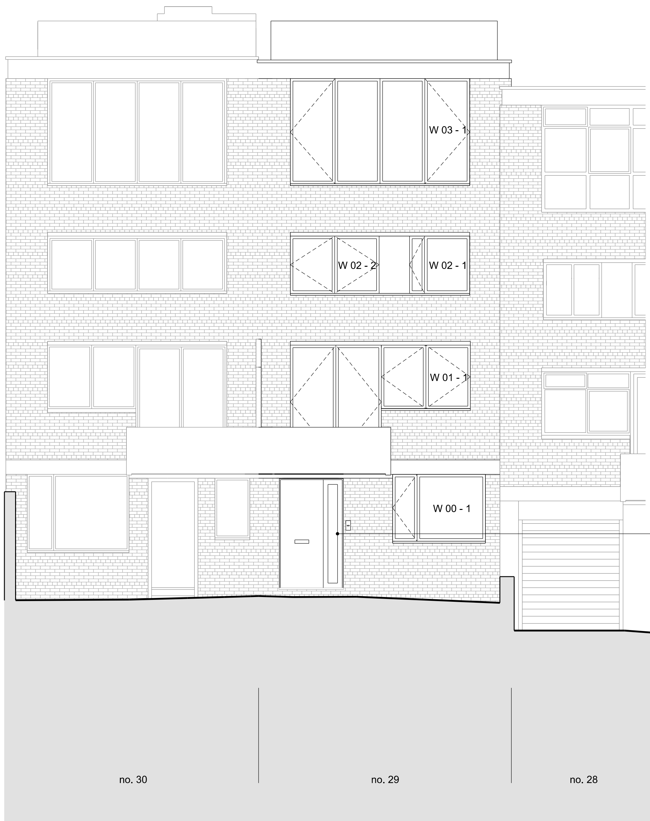
01 Proposed Front Elevation Scale 1:50 @A1 / 1:100 @A3