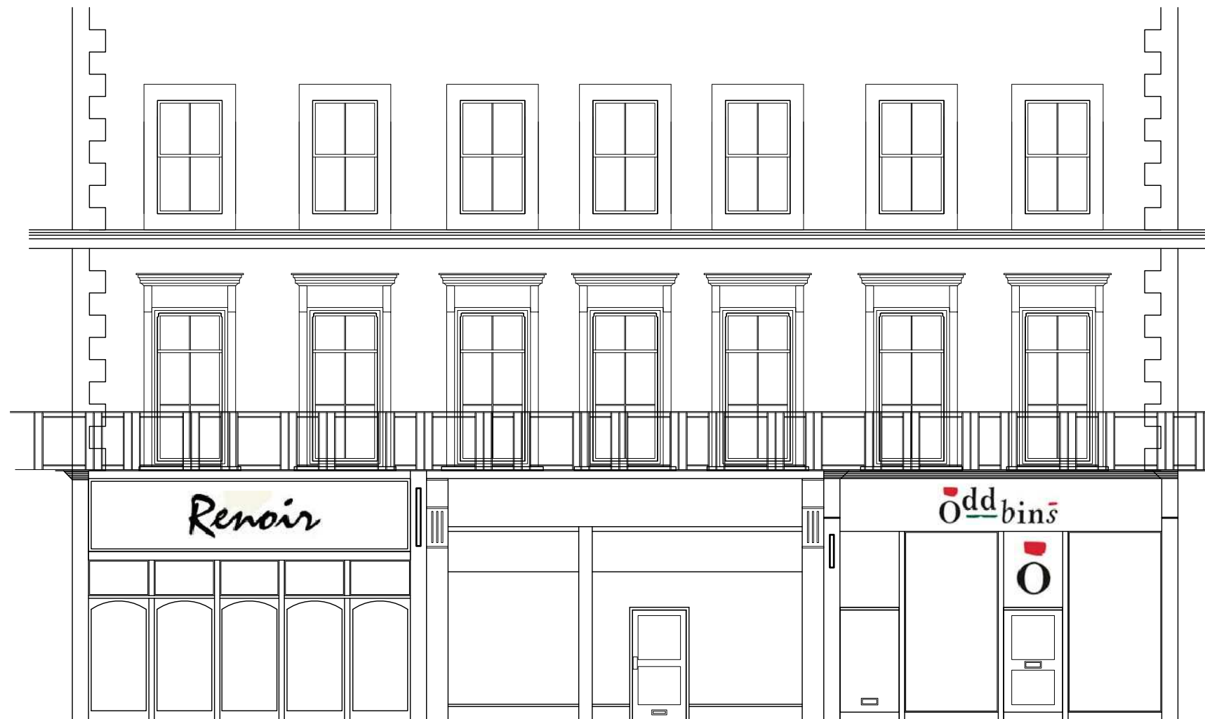
EXISTING KENTISH TOWN ROAD ELEVATION

Rev. Date Comments Where no dimensions are given drawings should not be scaled and the matter should be referred to ICEWIT DESIGN PTN Should dimensions or details on these drawings conflict precedence shall be given to the larger scale drawings. Where this drawing relates to existing buildings or completed construction the contractor shall check that there is no conflict between actual building dimensions and drawing dimensions. In the event of conflict between this drawing and subcontractor's working drawings for relevant building components the subcontractor's drawing shall take precedence. Such conflicts noted above shall be reported immediately ICEWIT DESIGN PTN It is forbidden to reproduce this drawing in part or full without the written permission of ICEWIT DESIGN PTN All Dimensions are in Millimetres unless otherwise stated. ICEWIT DESIGN PTN 145 BATTERSEA BUSINESS CENTRE 103-109 LAVENDER HILL LONDON SW11 5QL TEL : 0207 350 2930 FAX : 0207 350 2935 Client FOXTONS Project 242 KENTISH TOWN ROAD LONDON NW5 2AB Title EXISTING ELEVATION & PHOTO Scale 1:100 @ A3 Date APRIL 2015 0 1.0 2.0 4.0 m Drawing Number 8742/ EX-02 Rev.