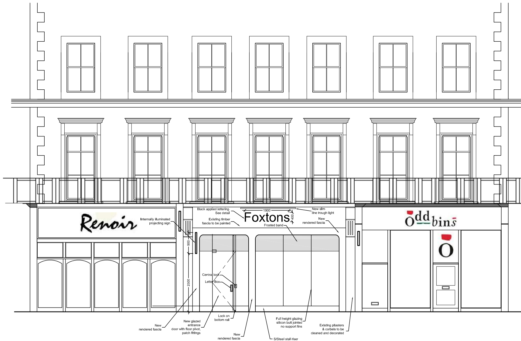
PROPOSED KENTISH TOWN ROAD ELEVATION