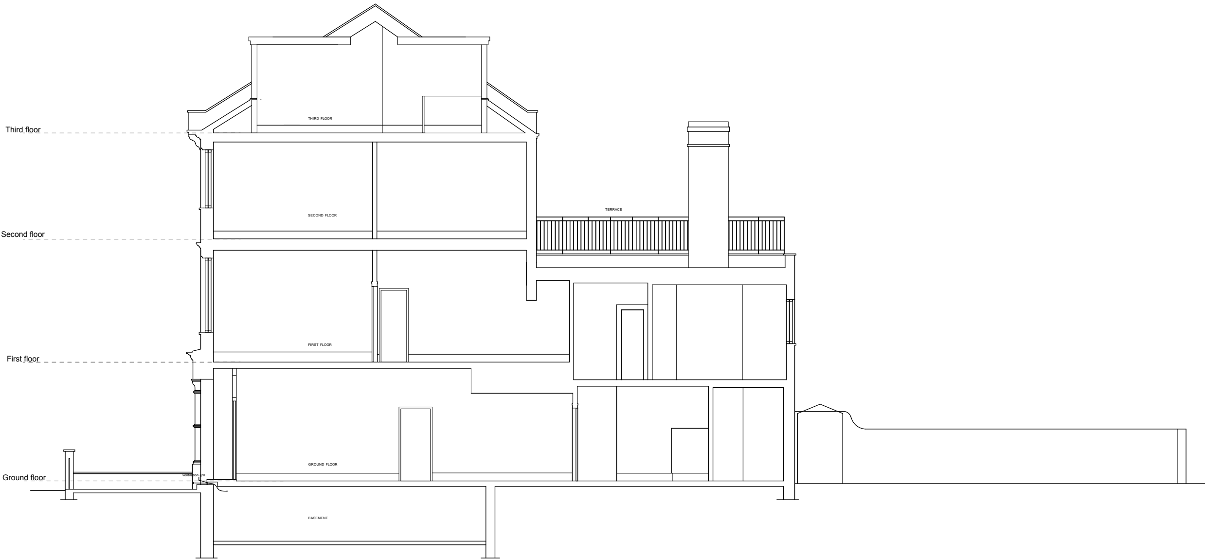
SECTION AA- PROPOSED