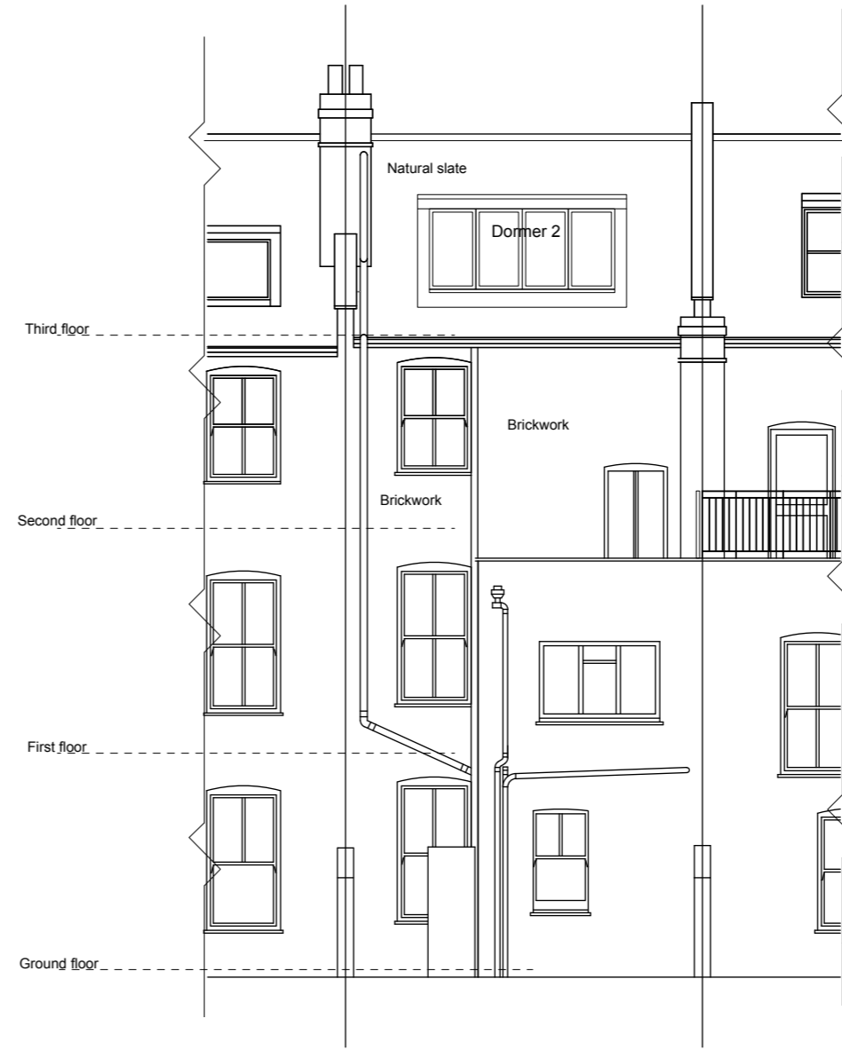
REAR ELEVATION- PROPOSED