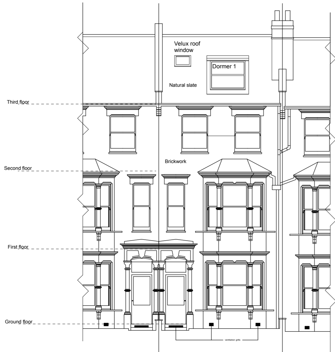
FRONT ELEVATION- PROPOSED