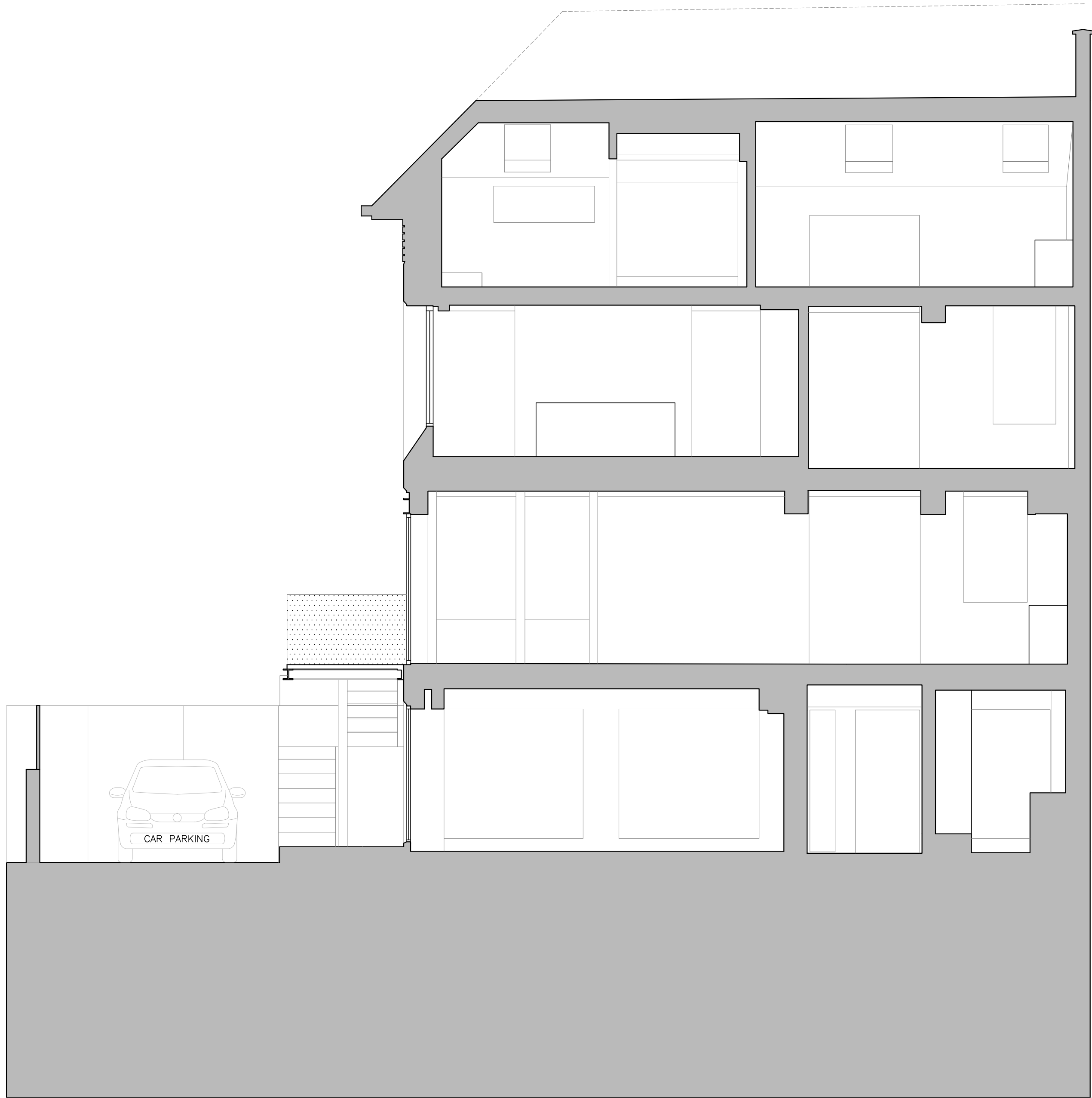
EXISTING BUILDING SECTION C:C