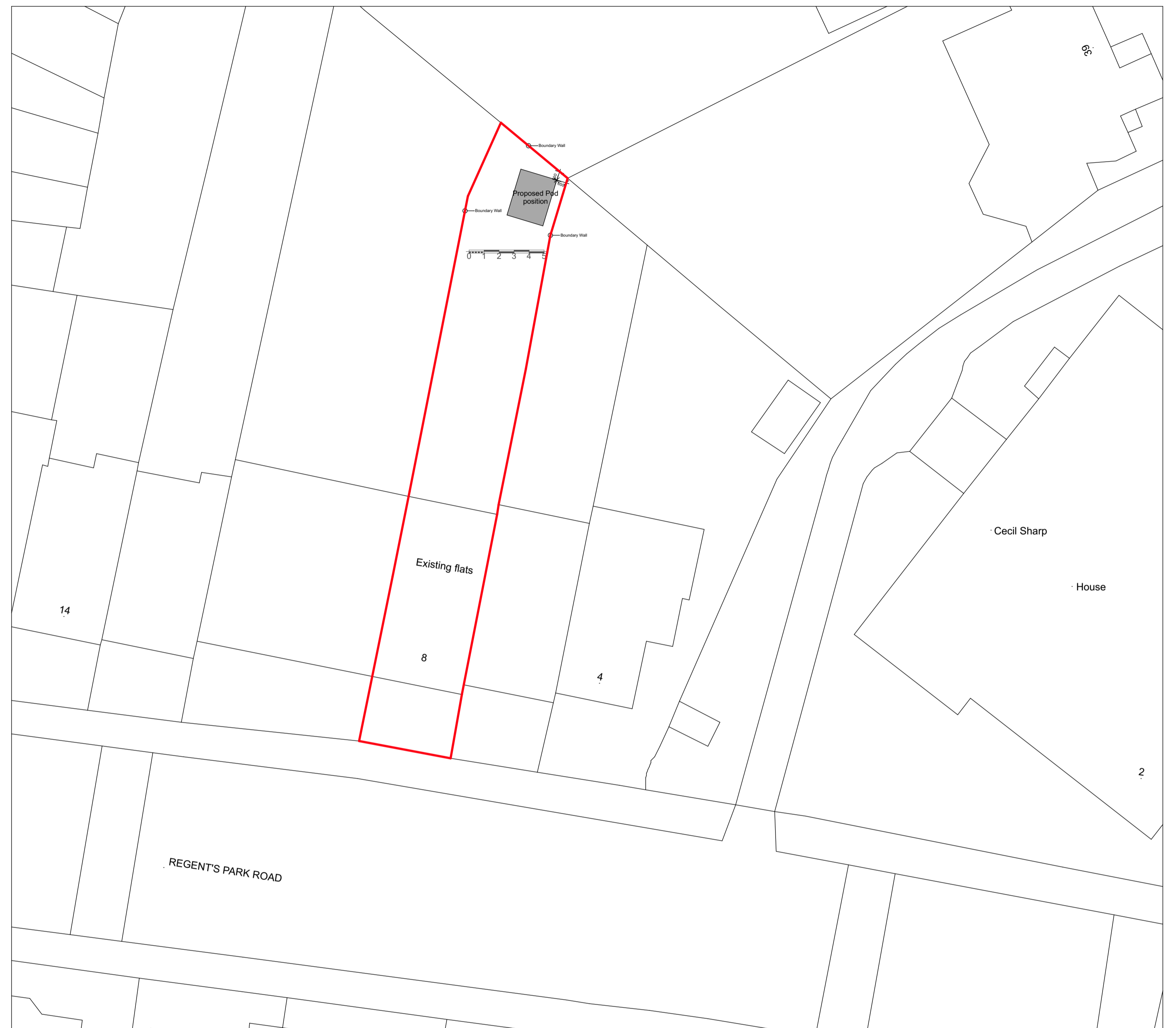
2. Site Plan 1:200

General Notes: Do not scale from drawing, use figured dimensions only. Pod space Ltd. to be notified of any discrepancies before commencement of work. Drawing not to be distributed or copied to third parties without prior written approval from Pod Space Limited.