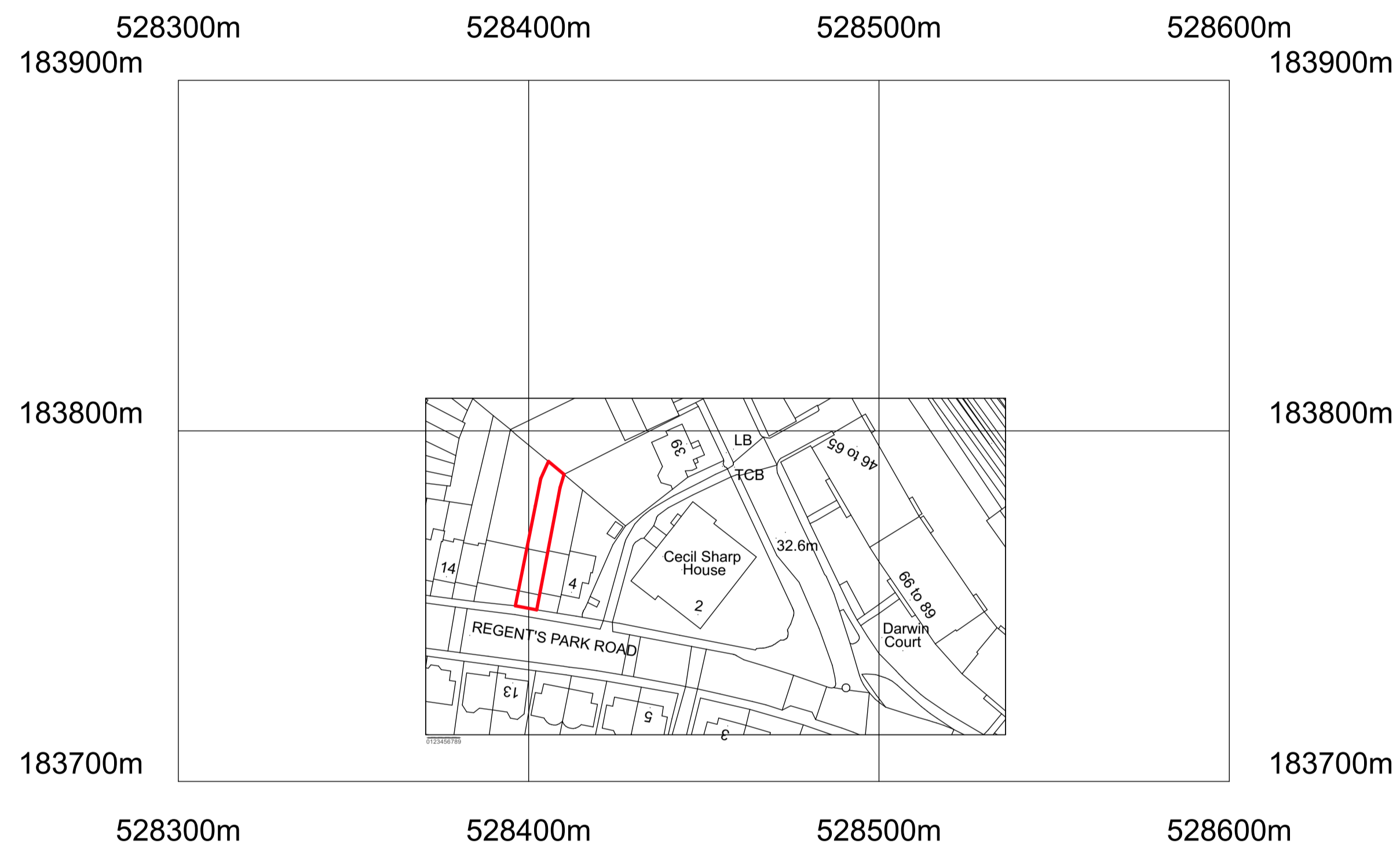
1. Location Map 1:1250