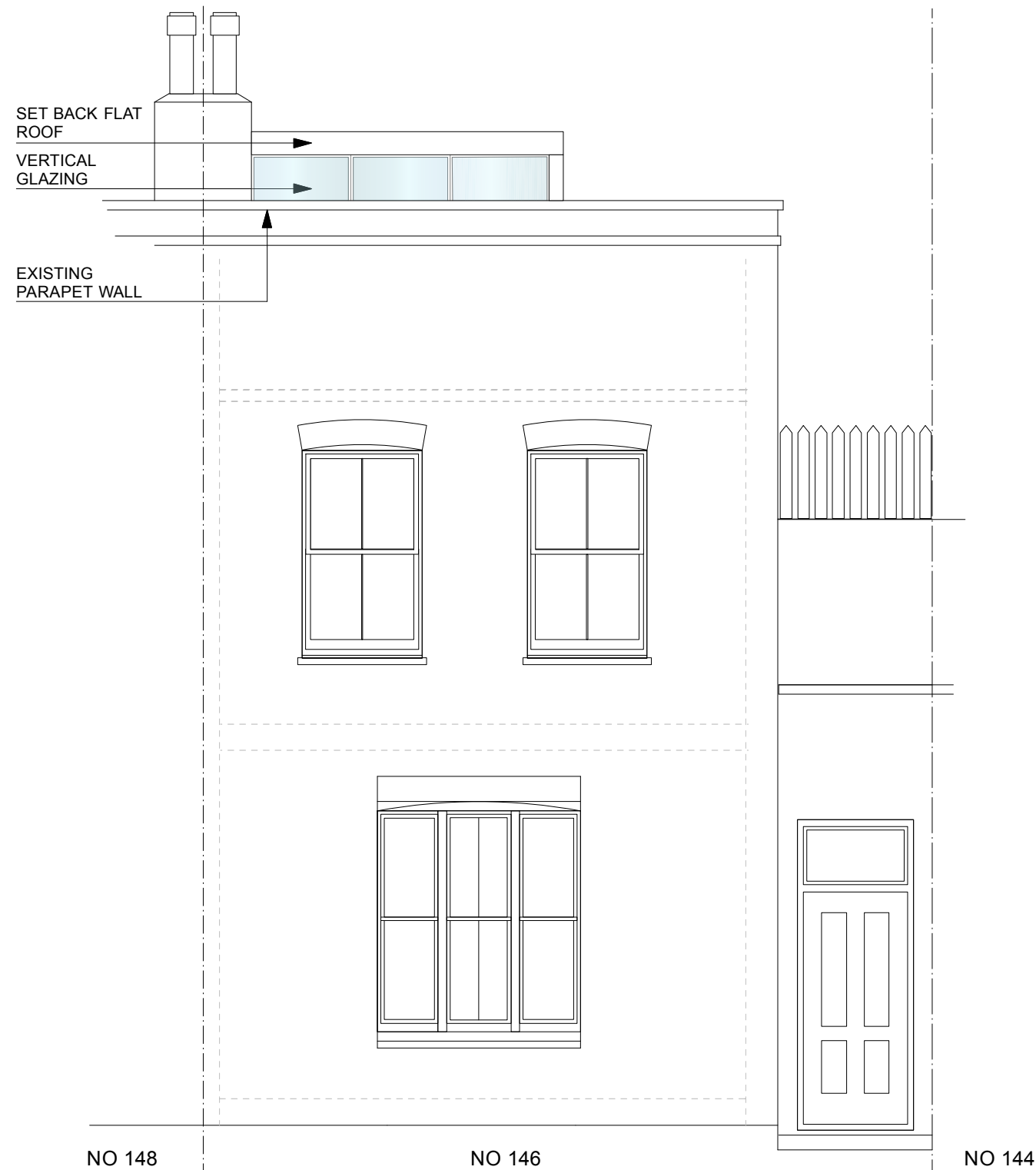
01 PROPOSED FRONT ELEVATION Scale: 1:50