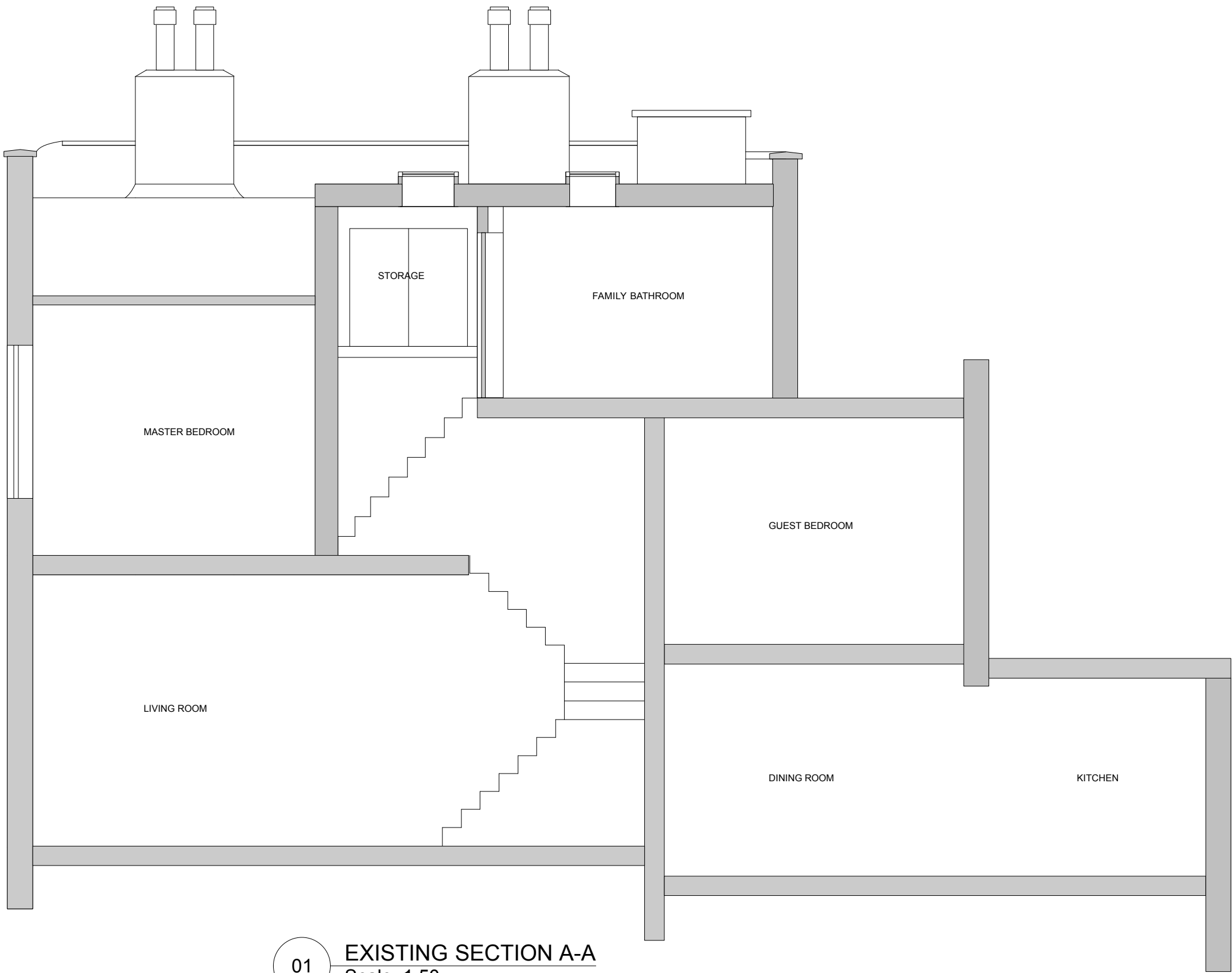
01 EXISTING SECTION A-A Scale: 1:50