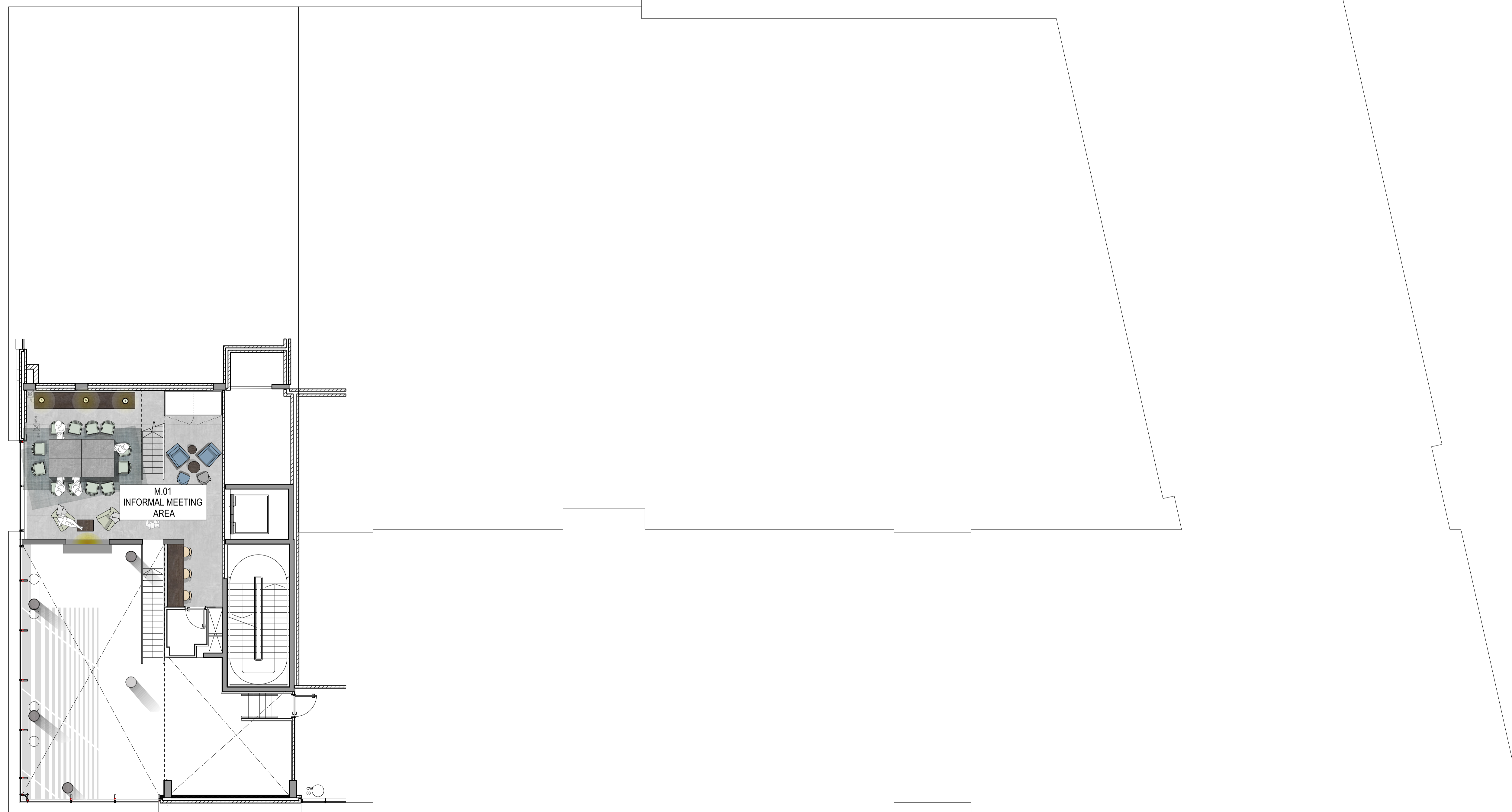
1 PROPOSED MEZZANINE FLOOR PLAN