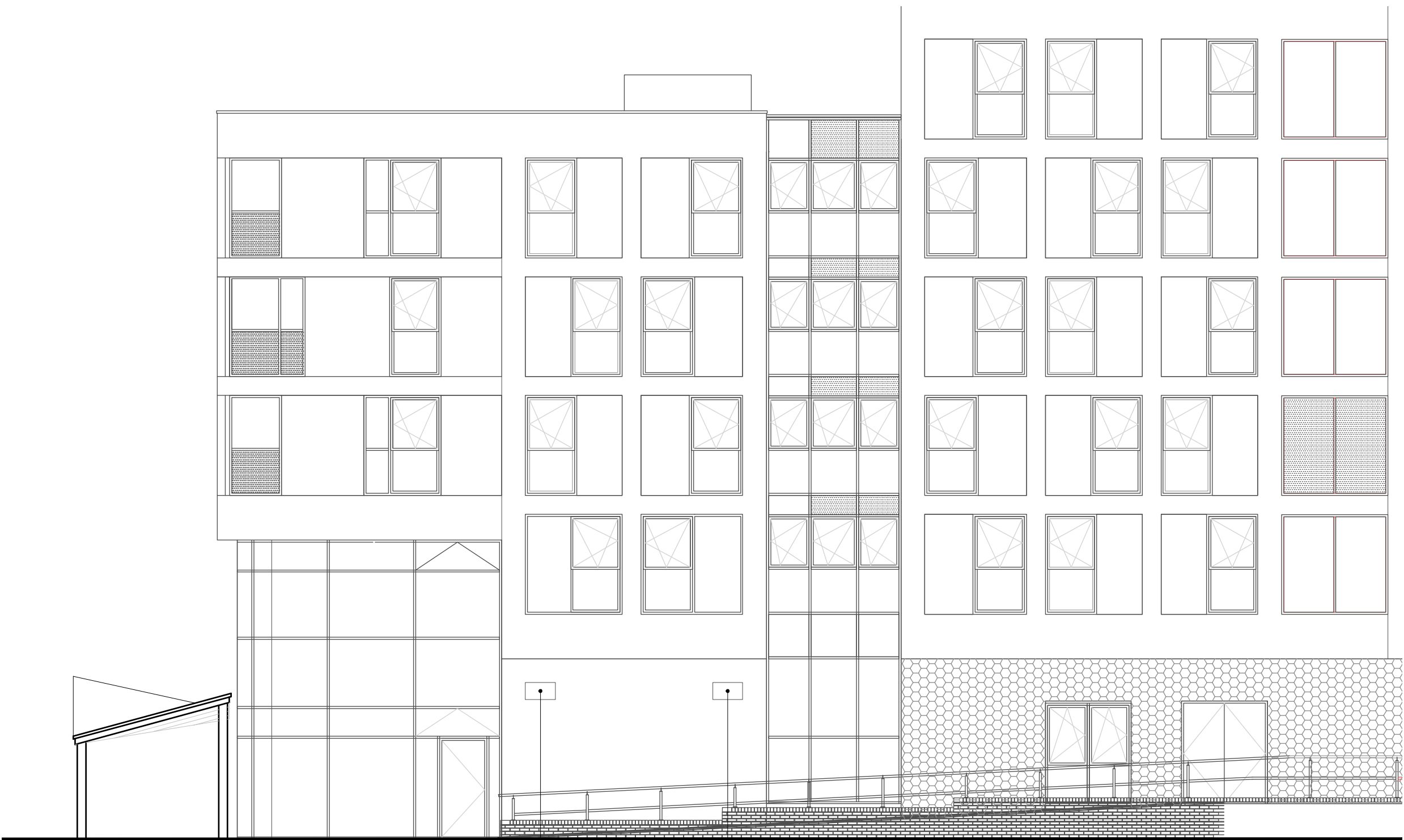
2 EXTERNAL ELEVATION AT 1:100