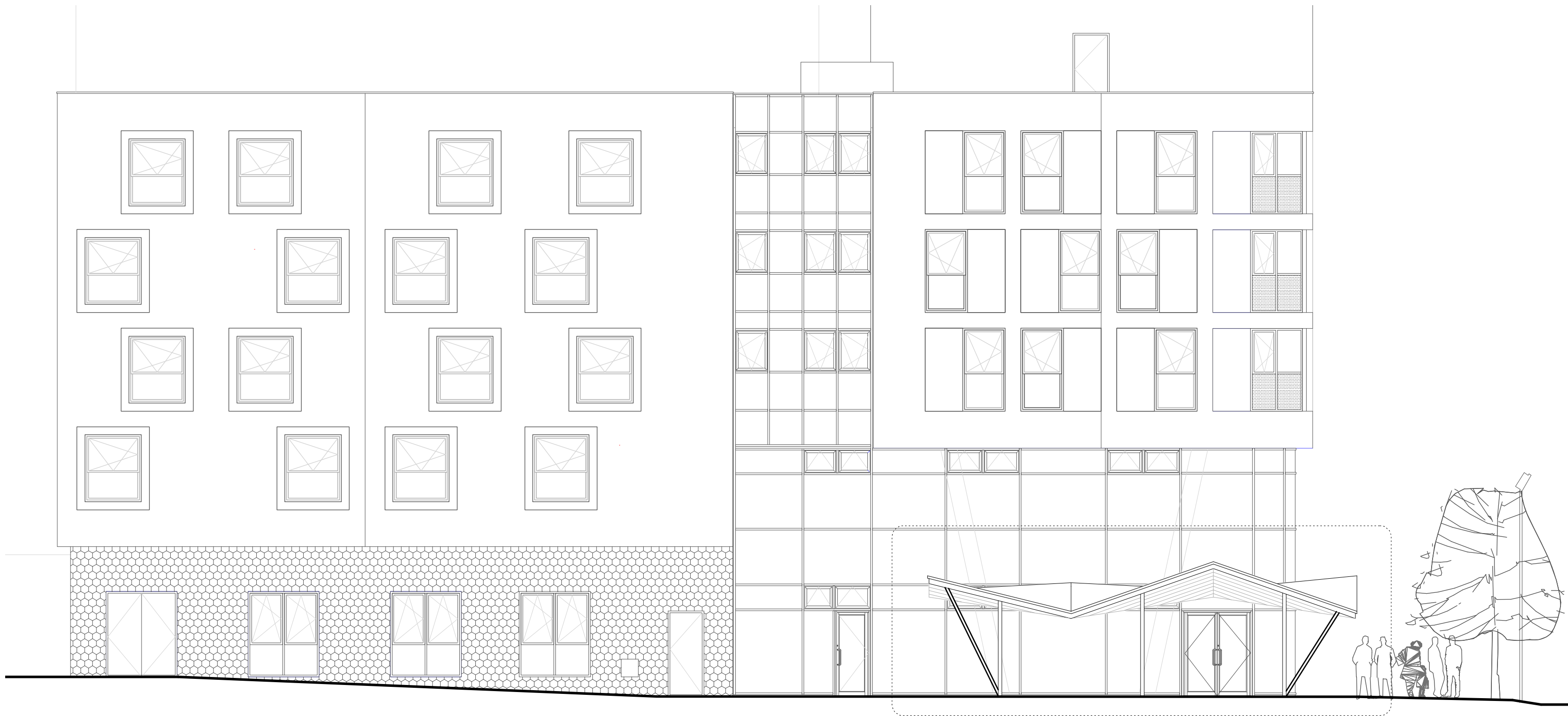
1 EXTERNAL ELEVATION AT 1:100