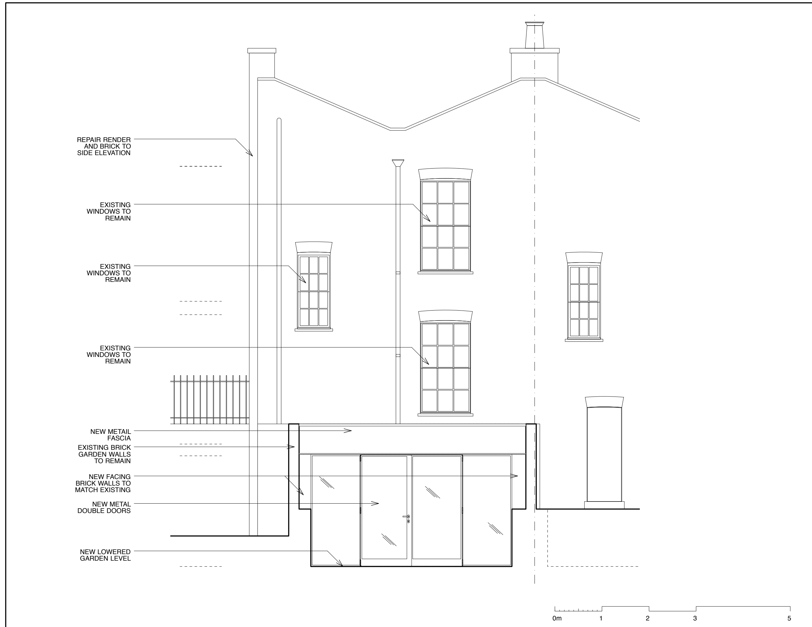
2 REAR ELEVATION - 1:50@A1

© Copyright Do not scale from this drawing! Contractors to confirm site dimensions before starting shop or working drawings