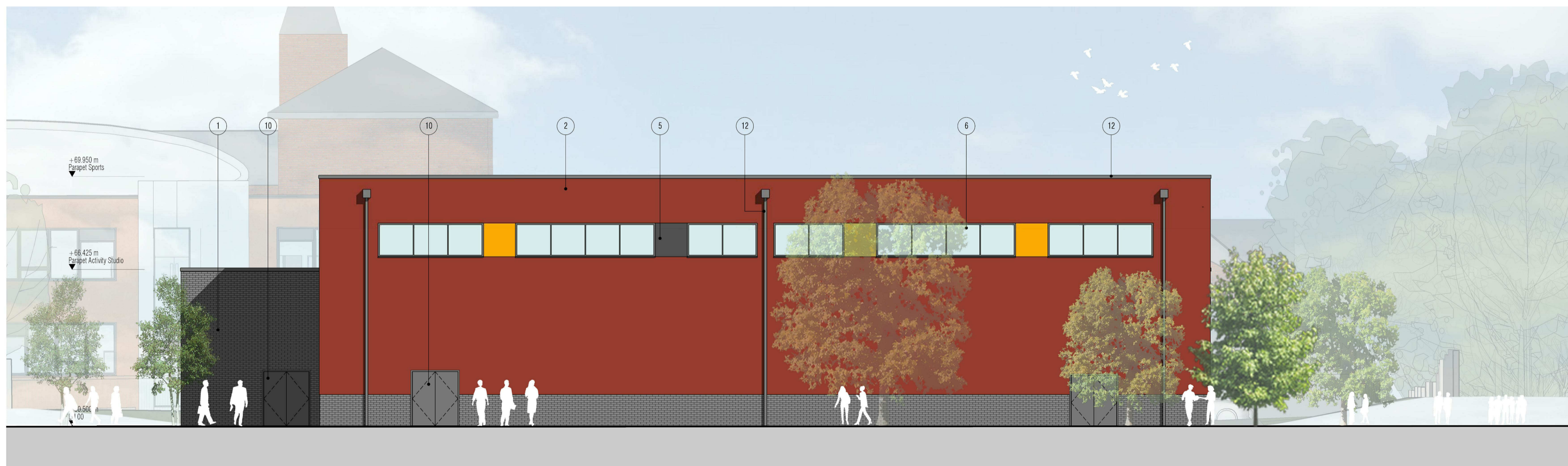
4 EAST ELEVATION JW-211/ 1:200

DO NOT SCALE THIS DRAWING. ALL DIMENSIONS MUST BE CHECKED ON SITE. INFORM THE ARCHITECT OF ANY DISCREPANCIES PRIOR TO CONSTRUCTION.