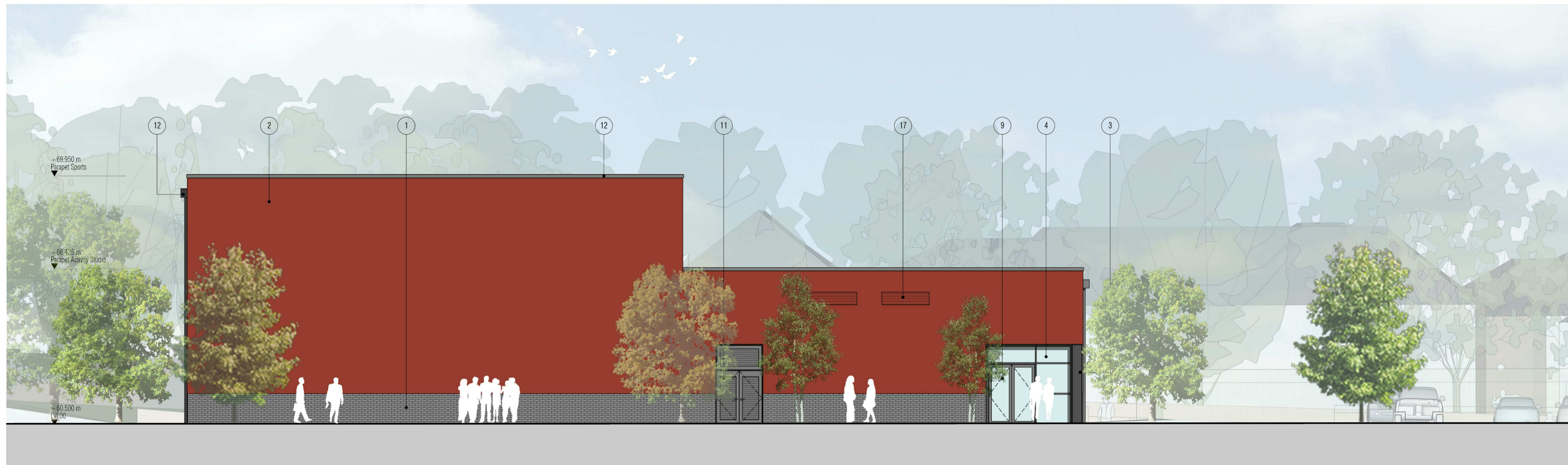
3 NORTH ELEVATION JW-211/ 1:200