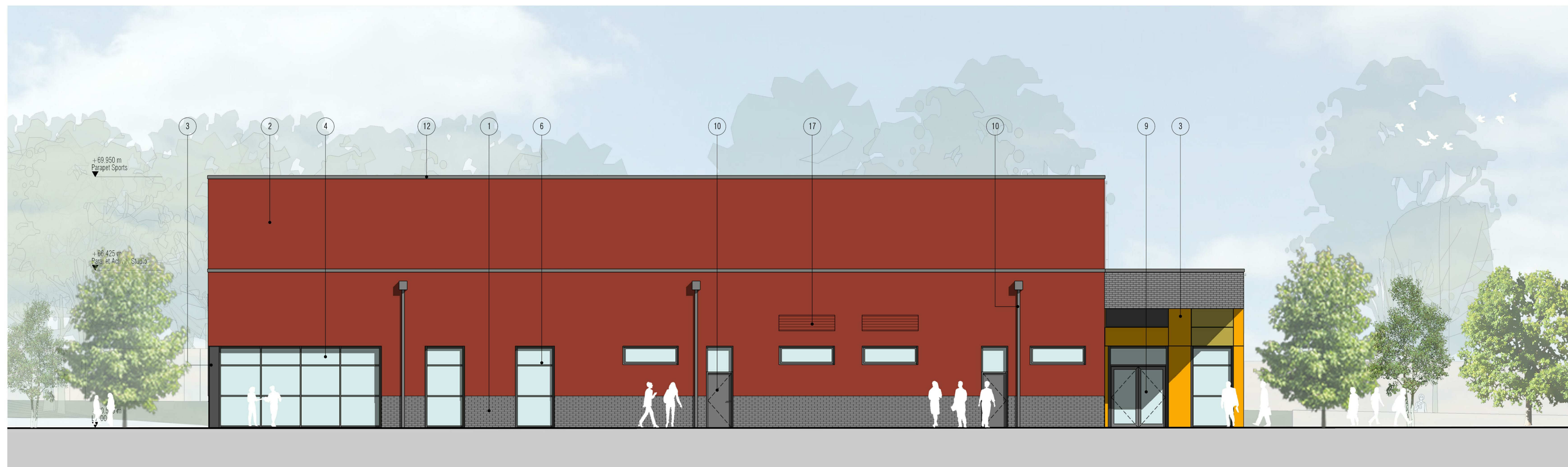
2 WEST ELEVATION JW-210 / 1:200