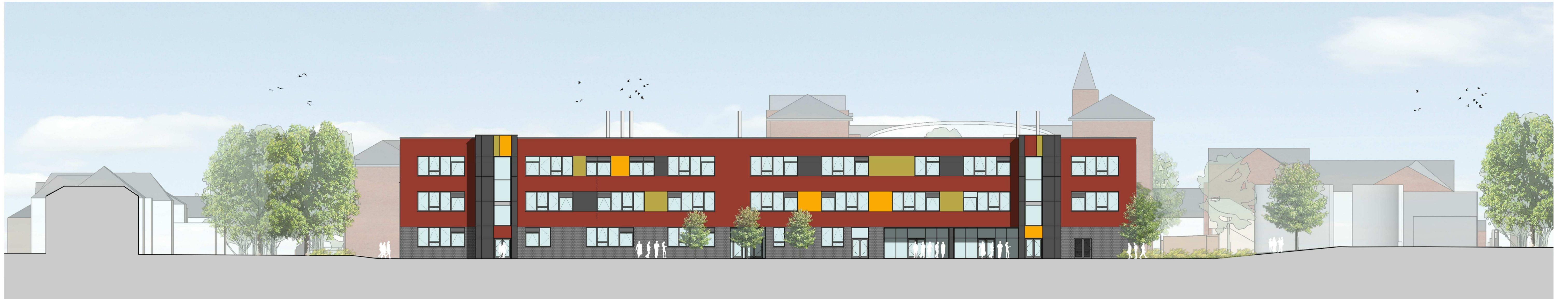
1 EAST ELEVATION JW-202 1:200