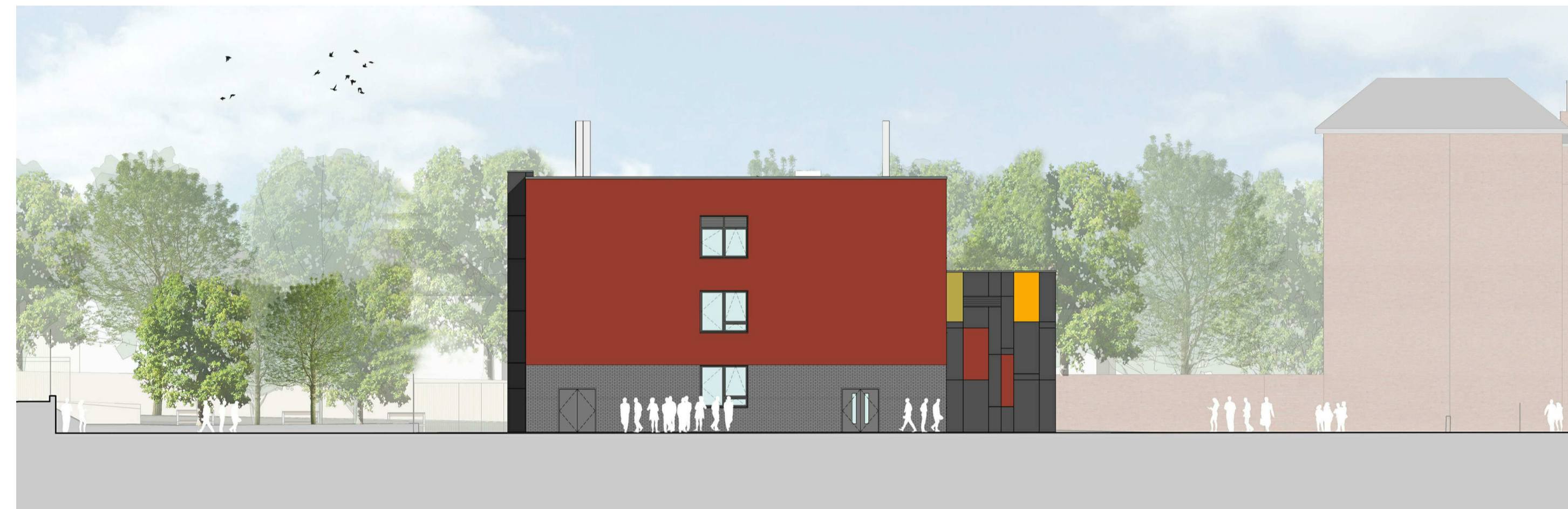
2 NORTH ELEVATION JW-202 1:200