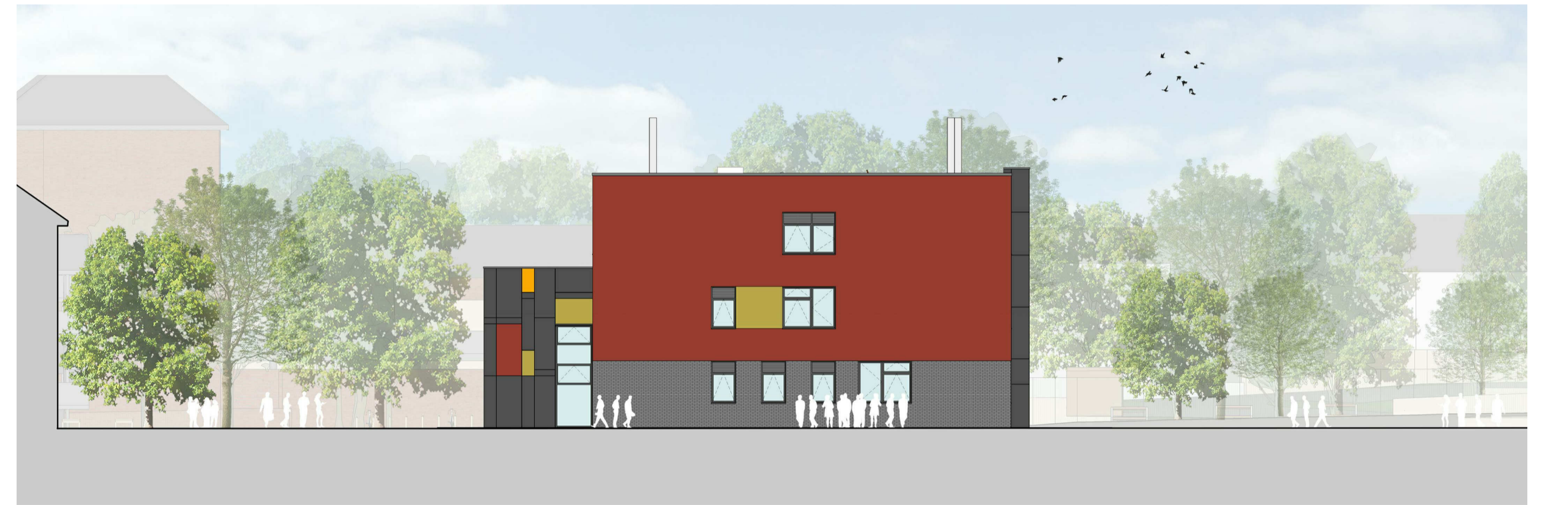
3 SOUTH ELEVATION JW-202 1:200