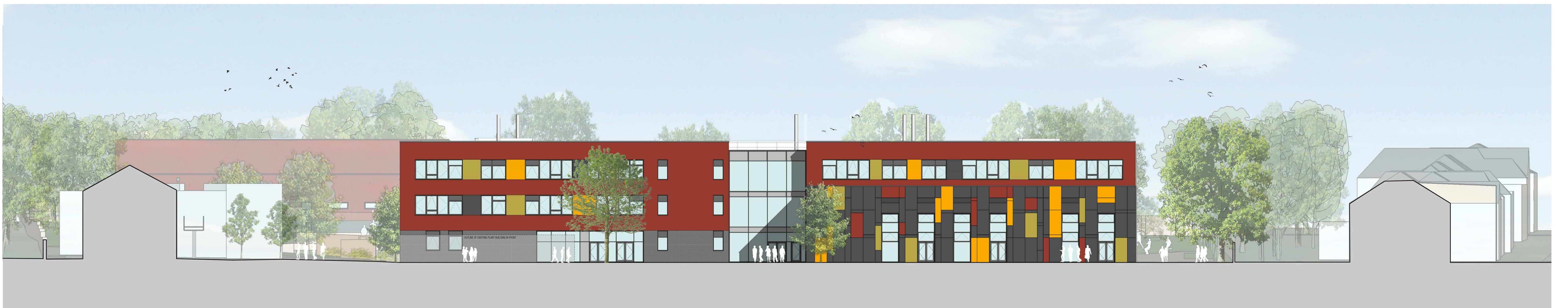
4 WEST ELEVATION JW-202 1:200

DO NOT SCALE THIS DRAWING. ALL DIMENSIONS MUST BE CHECKED ON SITE. INFORM THE ARCHITECT OF ANY DISCREPANCIES PRIOR TO CONSTRUCTION.