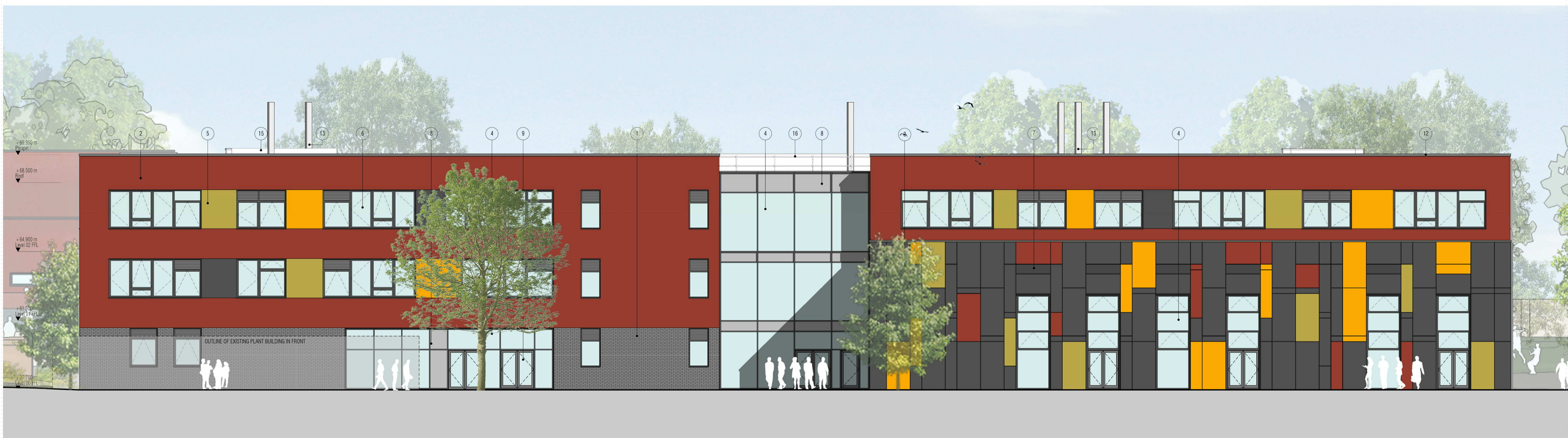
4 WEST ELEVATION JW-201 1:200