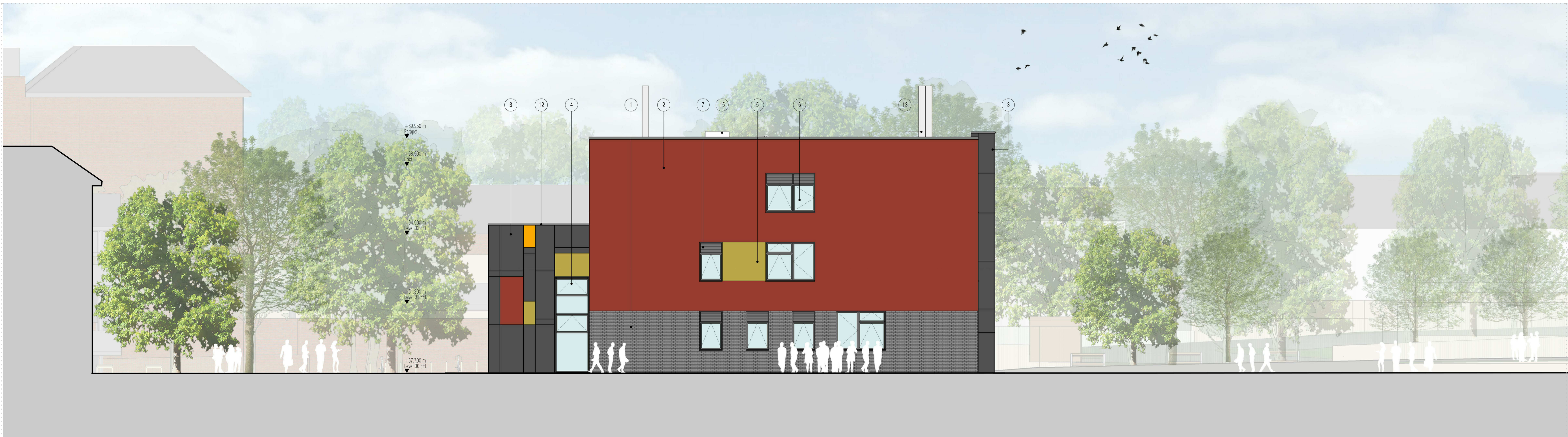
3 SOUTH ELEVATION JW-201 1:200