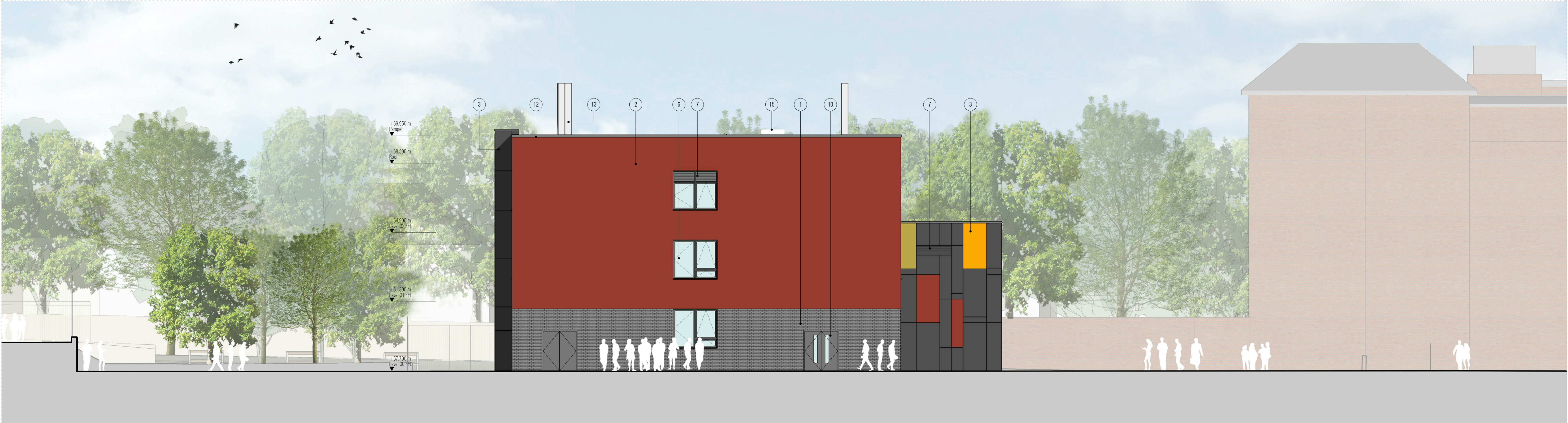
2 NORTH ELEVATION JW-200 1:200