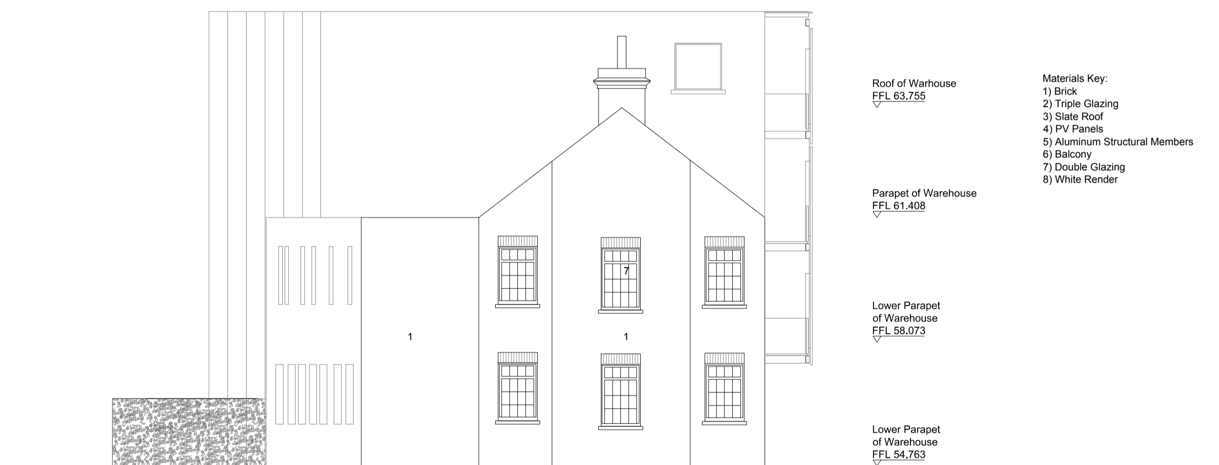
04 West Elevation Warehouse