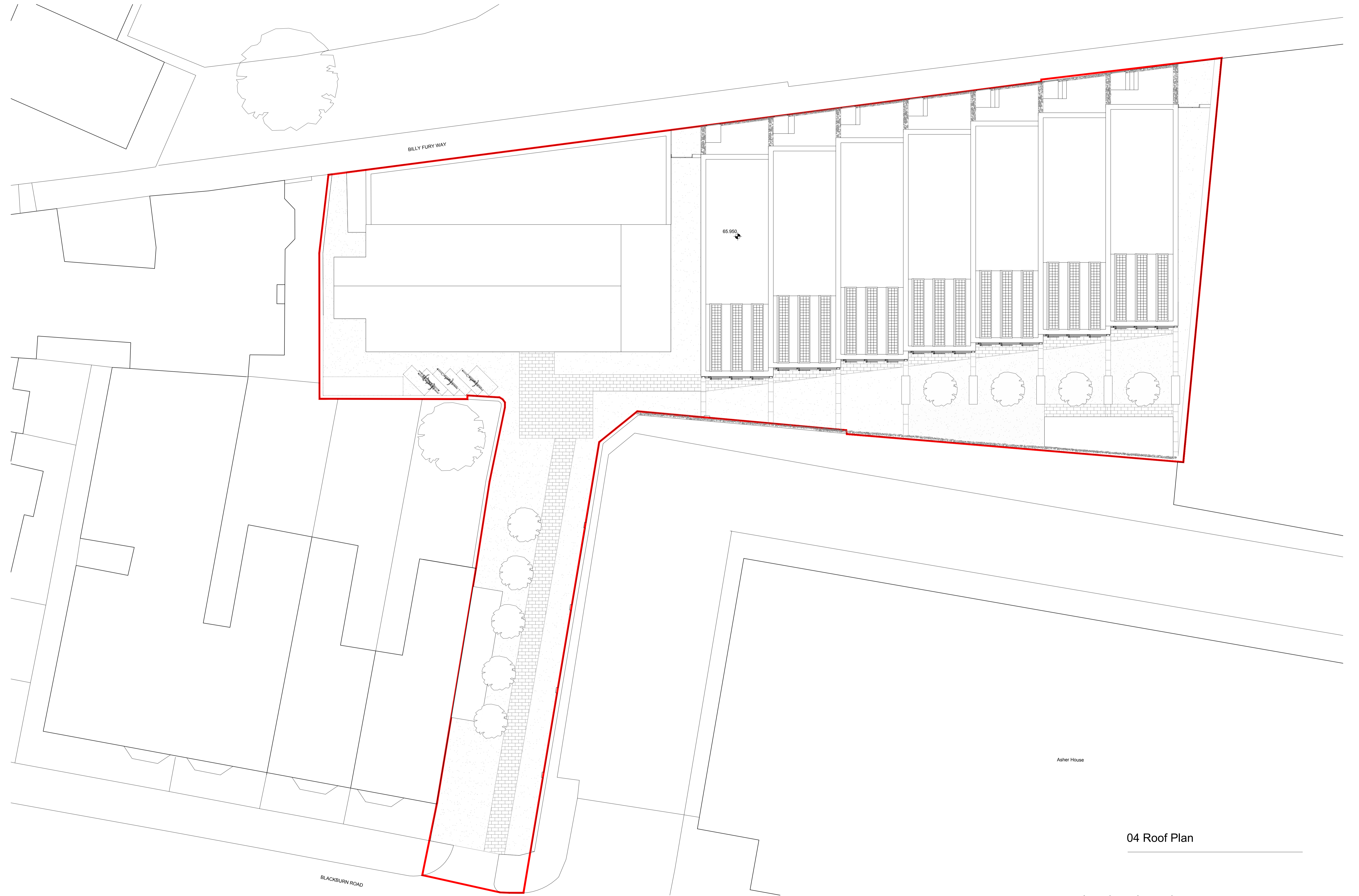
04 Roof Plan