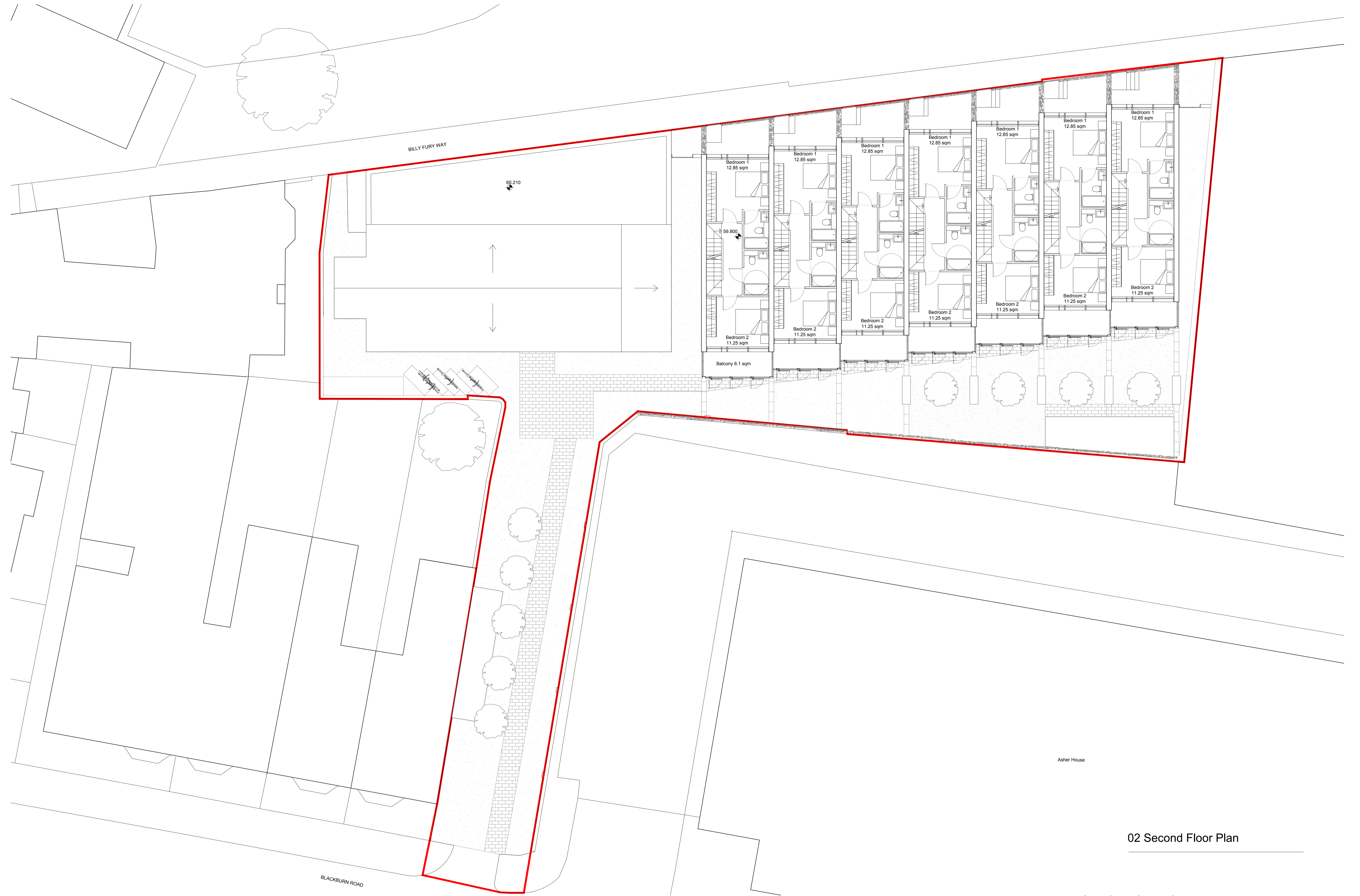
02 Second Floor Plan

Horden Cherry Lee Architects Limited © 36-38 Berkeley Square London W1J 5AE T 020 7495 4119 F 020 7493 7162 E info@hcla.co.uk Check all dimensions on site Do not scale drawing All dimensions in millimetres