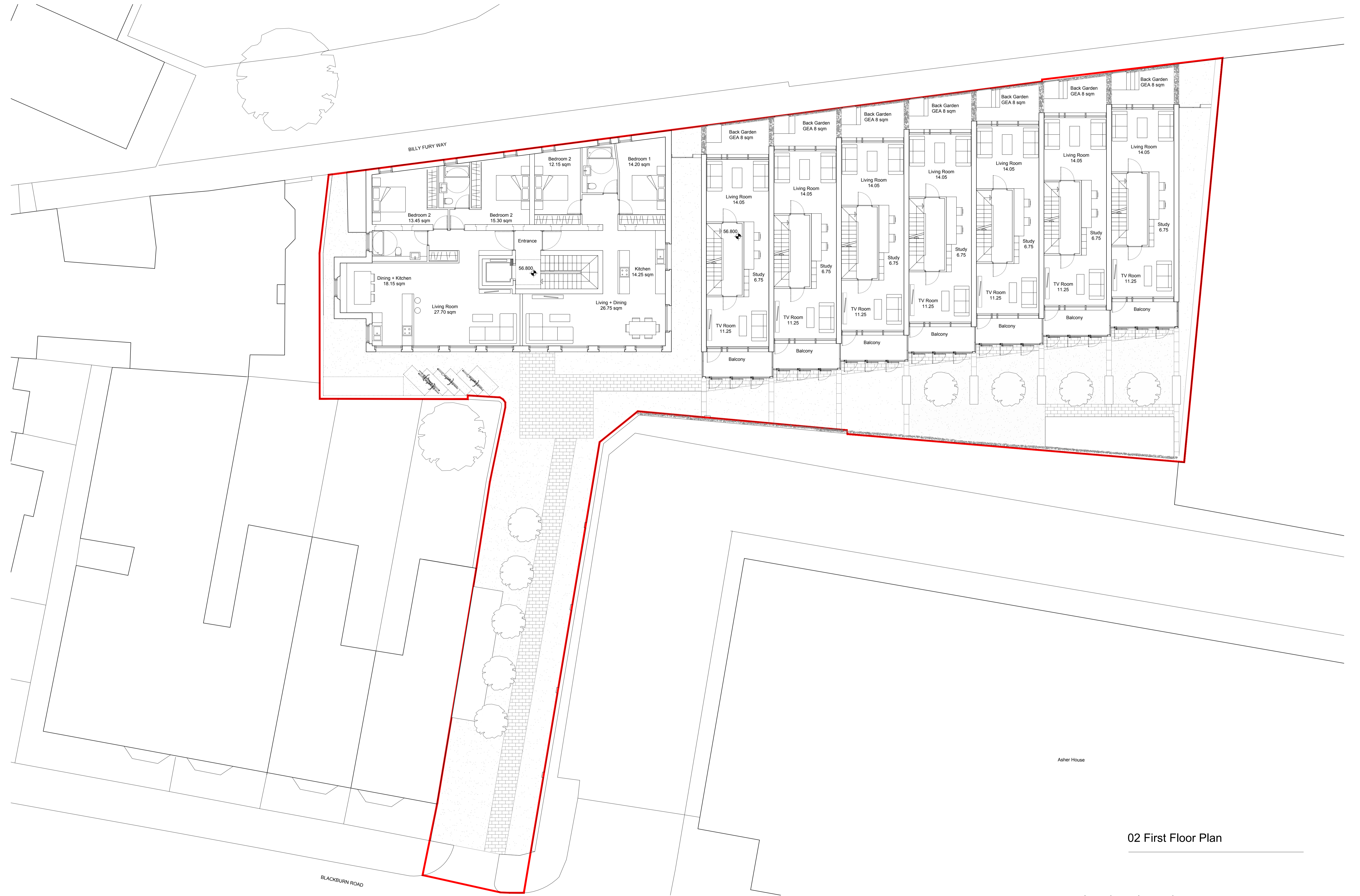
02 First Floor Plan

Horden Cherry Lee Architects Limited © 36-38 Berkeley Square London W1J 5AE T 020 7495 4119 F 020 7493 7162 E info@hcla.co.uk