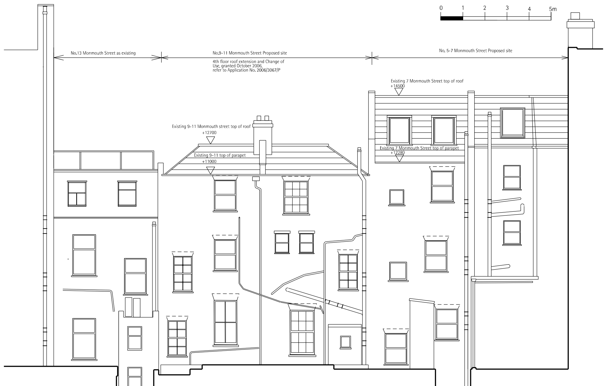
1. Existing Rear elevation Scale 1:50@A1