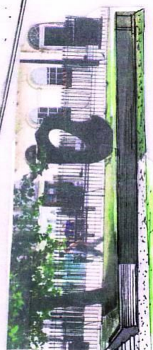
PROPOSED NEW STEPS