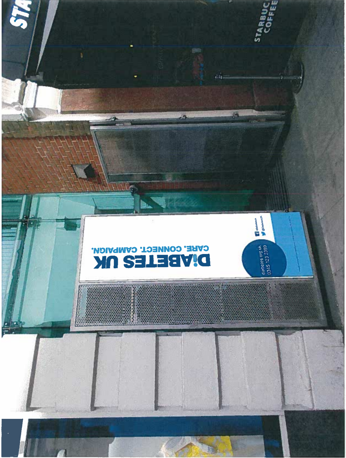
*Refer to visual on page 3 for artwork.