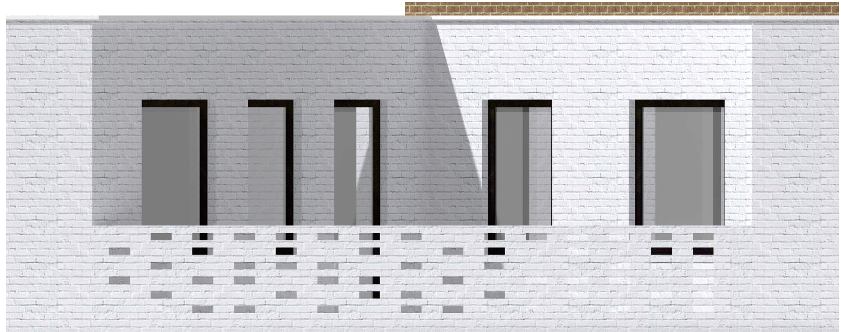
Perforated Brick Wall Elevation - Off white brick