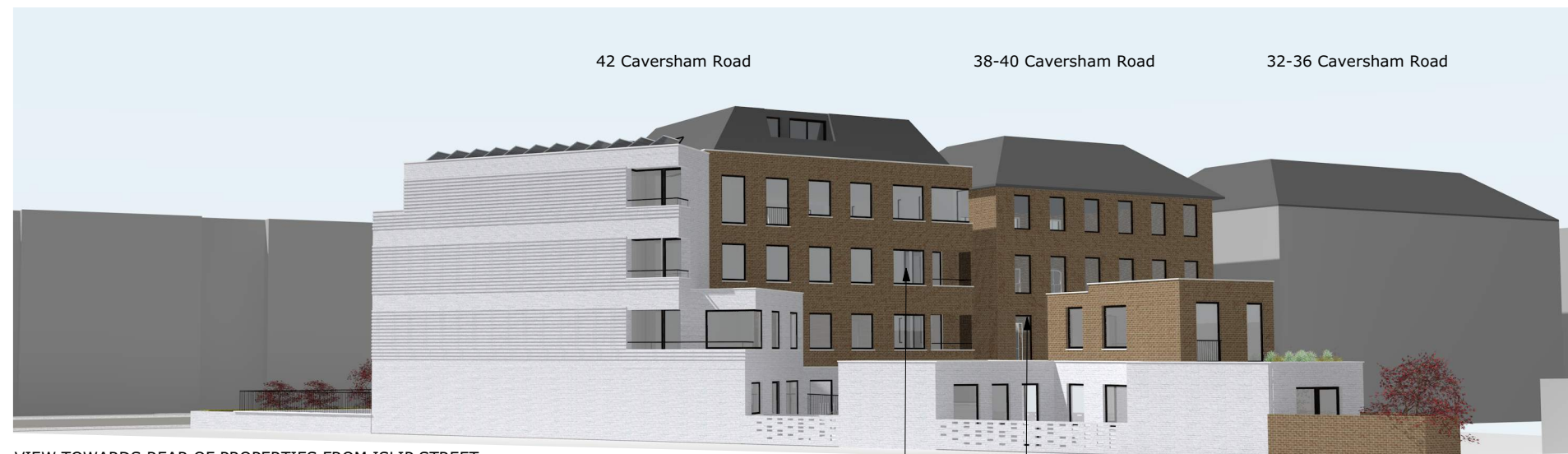
VIEW TOWARDS REAR OF PROPERTIES FROM ISLIP STREET

View through site to strong rear elevations is maintained with low-lying mews houses at the rear of the site