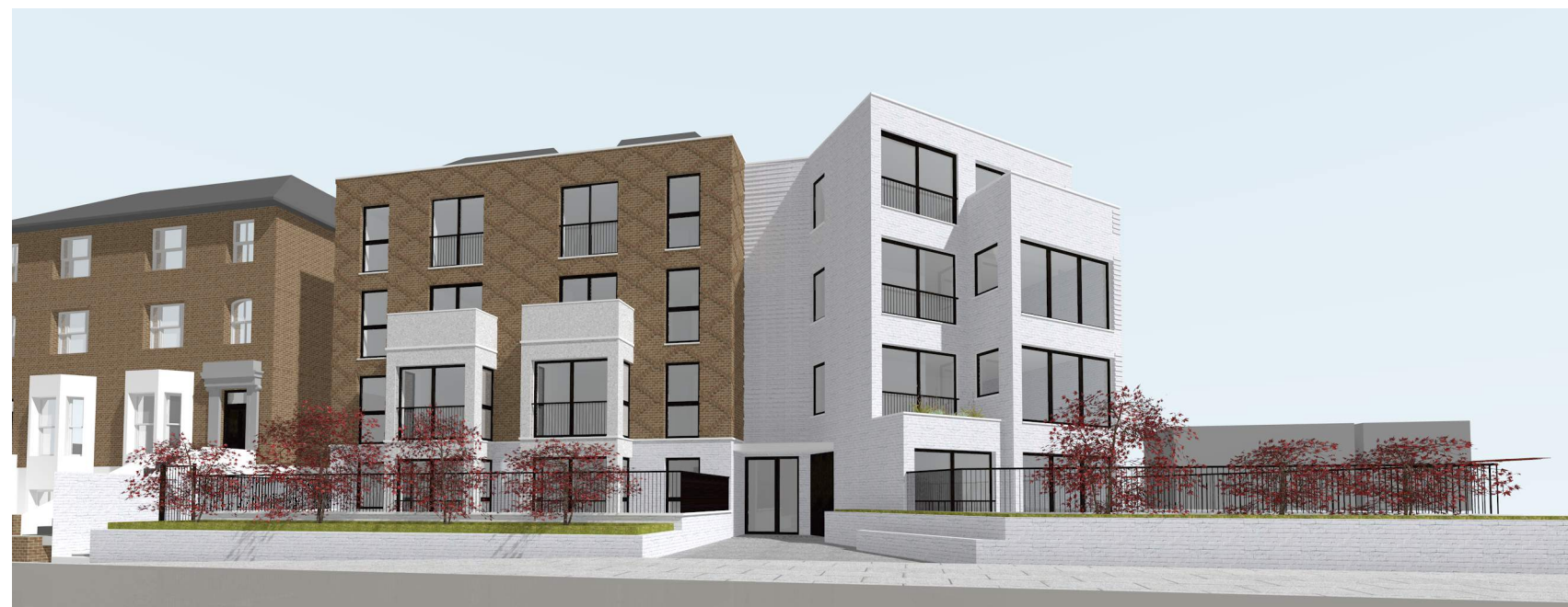
VIEW TOWARDS COMMUNAL ENTRANCE

Windows continue rhythm of neighbouring properties