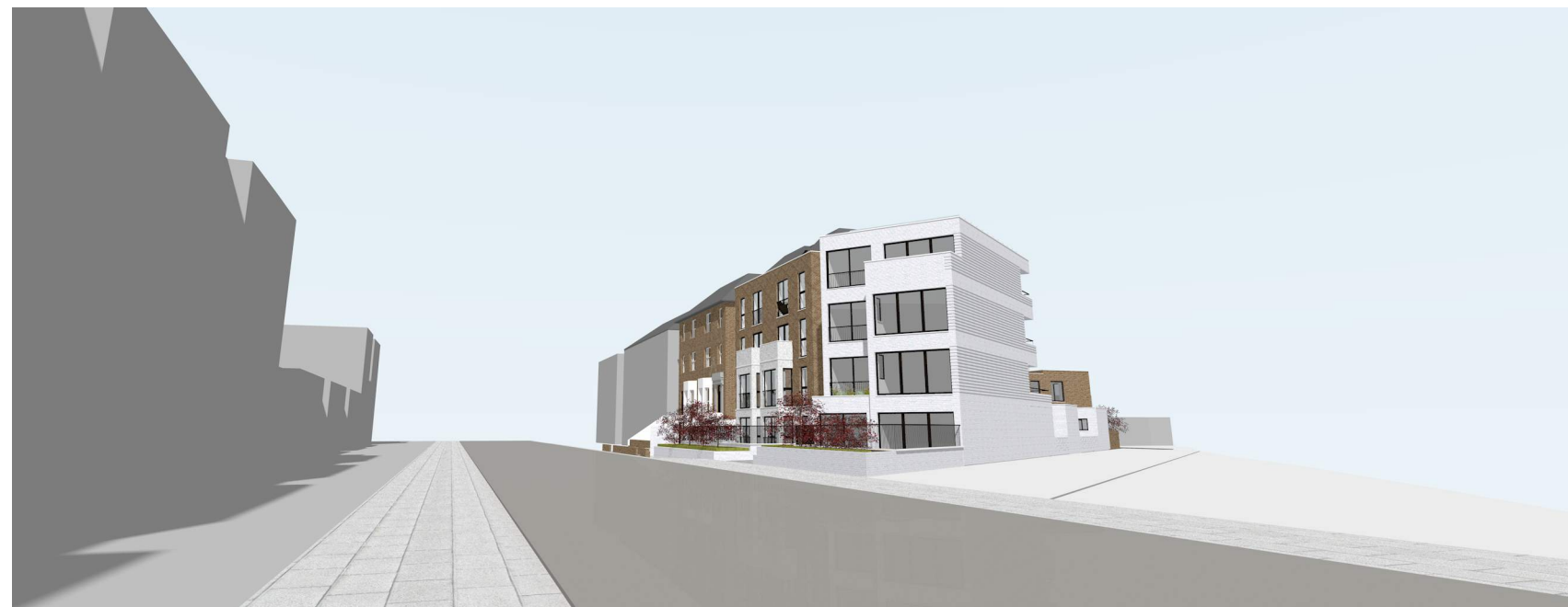
VIEW LOOKING WEST ALONG CAVERSHAM ROAD