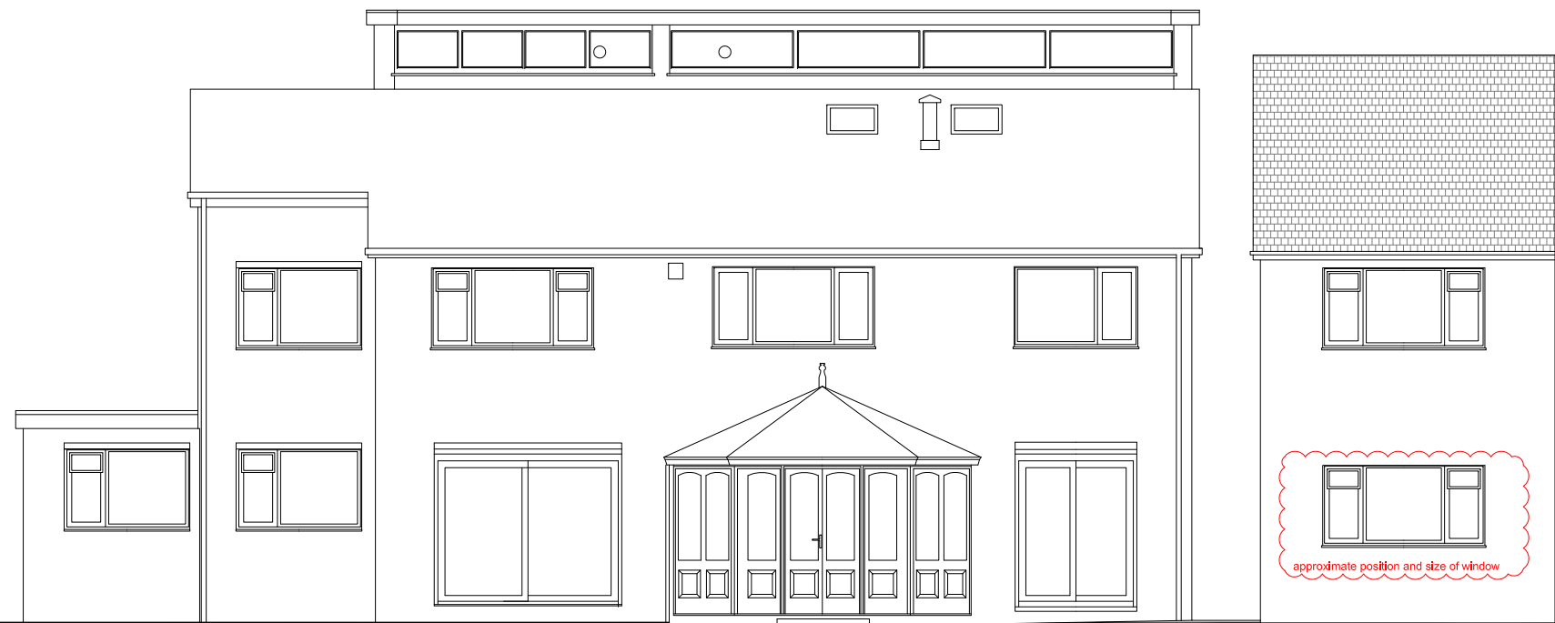
Elevation B - B